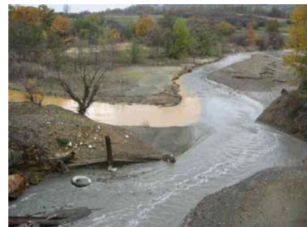
Dead Borska river polluted by acid mine drainage (right) and wastewater from battery factory (left), Bor, Serbia

mental and socio-economic problems resulting in national and regional disparities. Many of the communities believe that the way out is reorientation from mining towards other types of activities, mainly the development of tourism, agriculture, small scale industry, etc.