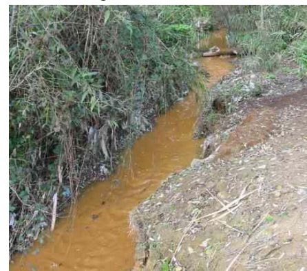
River Kiselica polluted by acid mine waters, Probištip Macedonia

From amongst the priorities recognised by those projects in the category of legal and policy development, the highest priority is given to the activities on elaboration of new sustainable development plans and spatial plans as well as to development of legislation, while in the category of treating technical priorities, the priority is given to activities focusing on the rehabilitation of contaminated areas and the treatment of mine waters. Beside these two categories, the documents also address the activities in the categories' institutional problems, information dissemination, education and scientific and research work, public participation and socio-economic aspects.