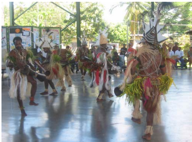
Dance group from Labu Tale

The Year of the Sea Turtle launch was held at the Coronation College in Lae on the 13th November. This event was supported by World Wide Fund for Nature and the PNG Department of Environment and Conservation.. Community groups from Labu Tale, Busama and Lababia.