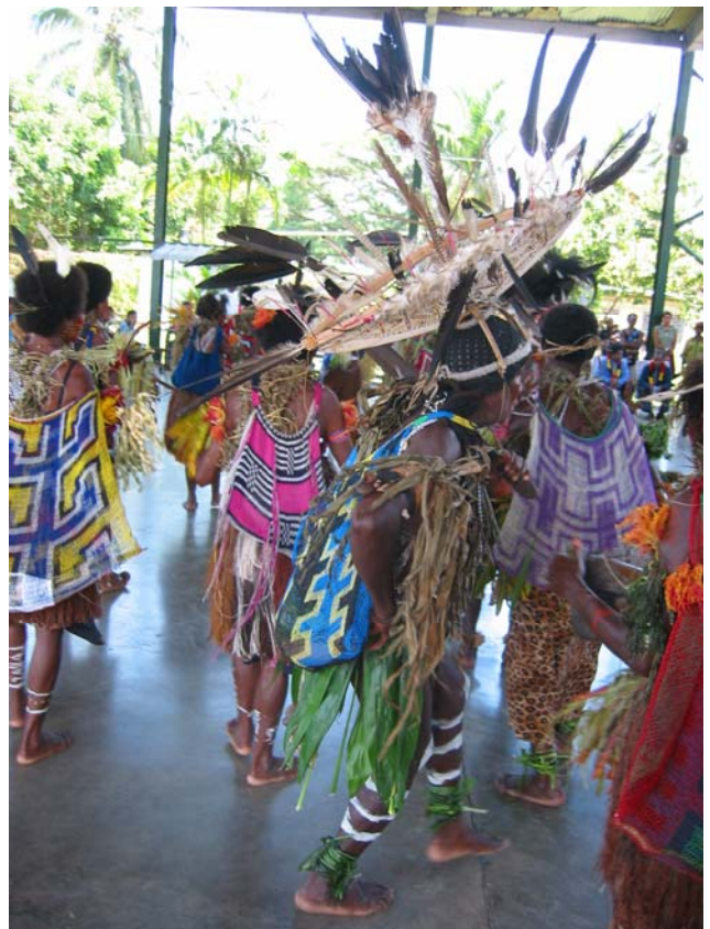
Dance group from Lababia