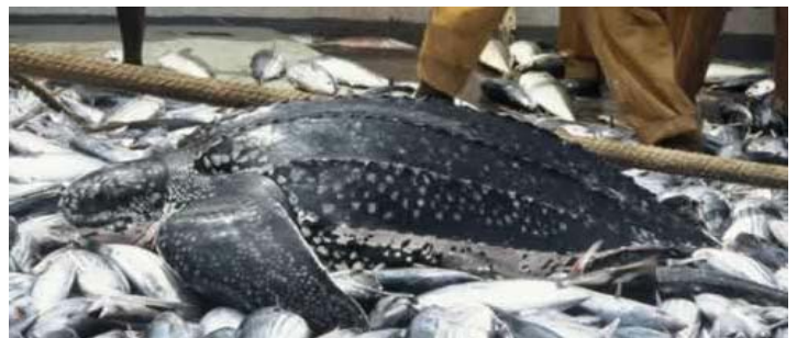
Leatherback turtle caught by a fishing boat