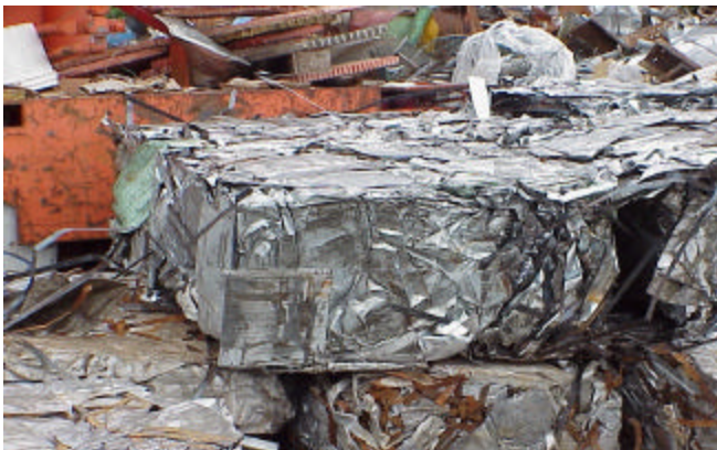
Figure 6: The Al-John crushes metal into large bales.

The economics of a shipment containing copper and PVC cable to New Zealand by ASPA have been detailed in the section – Case Study of Fees. In 2002, ASPA were also receiving USD1,350 for radiators and baled aluminium cans in New Zealand.