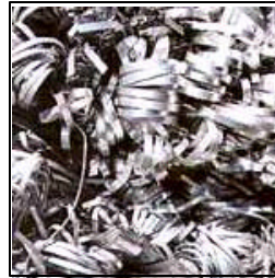
Figure 1: left - Aluminium scrap