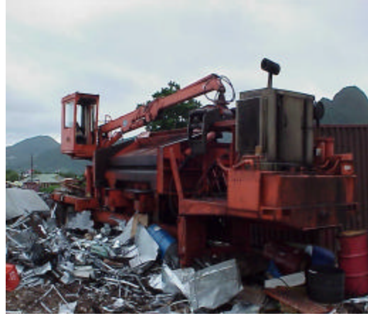
Figure 5: The Al-John Baler.

The scrap metal yard has a densifier for cans and a big baler, called an Al-John, for larger scrap metals, Refer Figure 5. The latter piece of machinery was purchased second hand from the United States. Figure 6 shows the large bales that are produced by the baler. Cutting torches with oxygen and acetylene is used to cut heavy equipment up into manageable pieces.