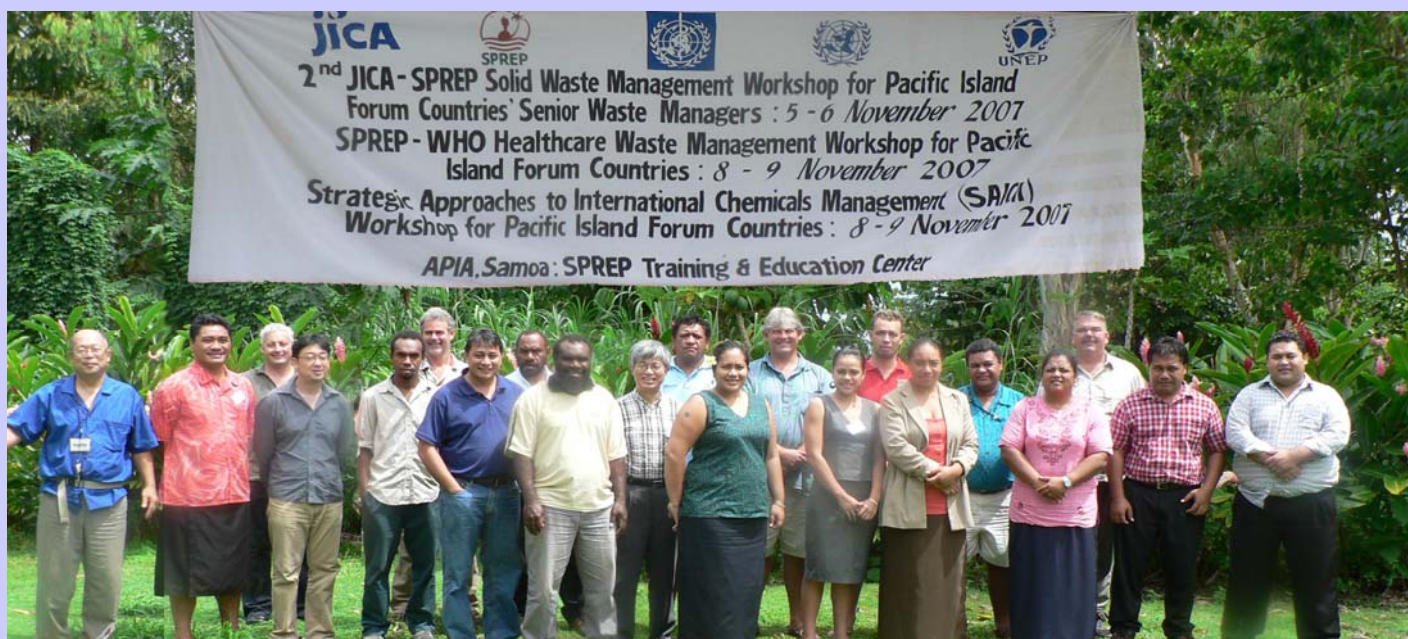
Participants in joint waste management training in Samoa, November 2007