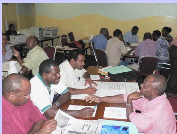
Developing SWM Strategy for PNG