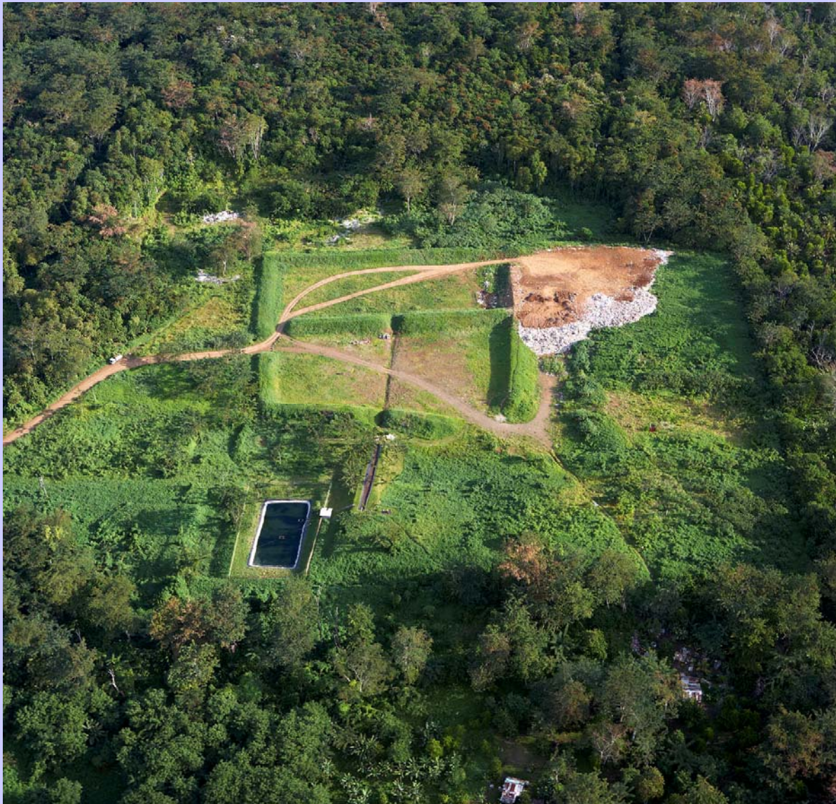
Aerial view of the Tafaigata Landfill in Samoa

It was clear that focusing on waste disposal alone by improving the landfill, only solved a part of the problem, and as a result the landfill will require expansion far sooner than was originally planned. The focus has now expanded to include measures that address waste minimization and reduction at source in order to reduce residual waste entering the Tafaigata Landfill.