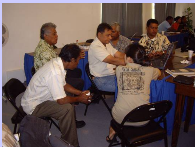
Developing SWM Strategy for FSM