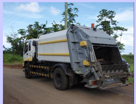
Typical collection vehicle in Samoa