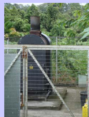
Medical Waste Incinerator in Samoa (left) and Solomon Islands (right)