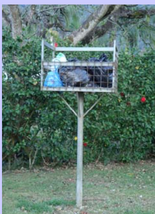
Rubbish stand in Samoa

When a waste collection service is available, public participation varies, and this can be measured by the amount of litter and illegal dumping activities taking place.