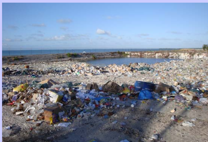
Dumpsite in Kiribati