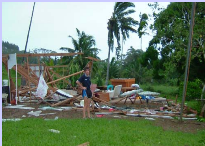
Cyclone damage in Cook Islands