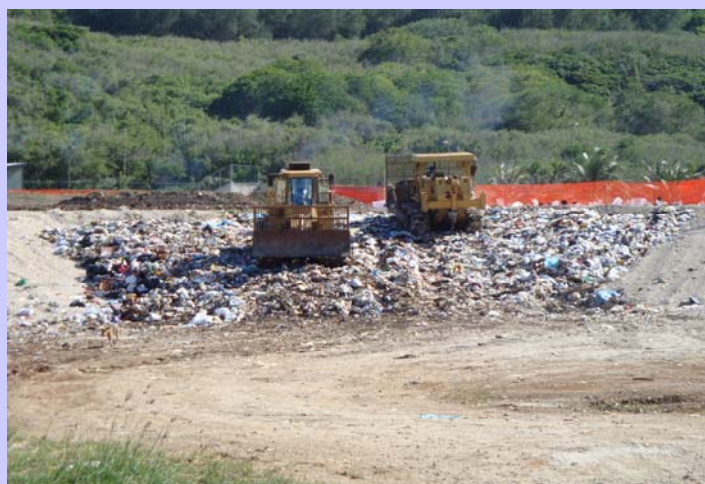
Anaerobic Landfill in Northern Mariana Islands