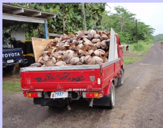
Typical collection vehicle in Samoa