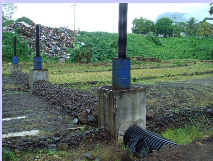
Tofol semi-aerobic landfill site in Kosrae, FSM

aerobic (Fukuoka-type) landfill. With funding provided from the Embassy of Japan in Pohnpei through Grass-roots grant assistance (US$90,900) and the Kosrae State Government (US$36,100), the transformation to semi-aerobic landfill was started in February 2006 and took almost 2½ years to complete. As a result, Kosrae State has a sanitary facility to deal with the disposal of waste from its four municipalities. Similar rehabilitation works have taken place in Palau at the M-Dock site, and also in Vanuatu and Samoa.