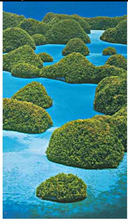
Figure 1.1 – Rock Islands from the Air

There is evidence that Palau has been populated for at least 5000 years by people most likely from the Philippines, Malaysia, Indonesia and Melanesia. The recorded population has varied from over 50,000 in the 1800s to a low of around 3500 in the early 1900s 2 . The 2000 census found a population of 19,129 that included 13,364 of Palauan origin, 4882