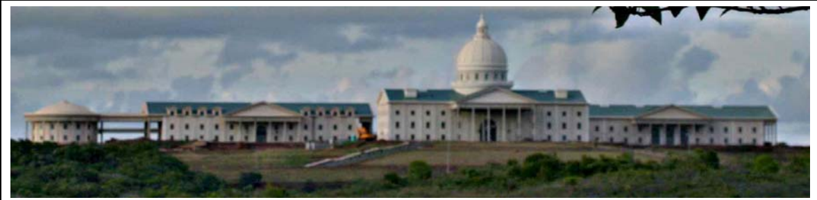
Figure 1.2– The Palau National Capitol Complex (February 2004)

Water supply is also mostly from public sources and is provided by the national government with bills paid separately from those of the PPUC to the “Utility Collection Office.”