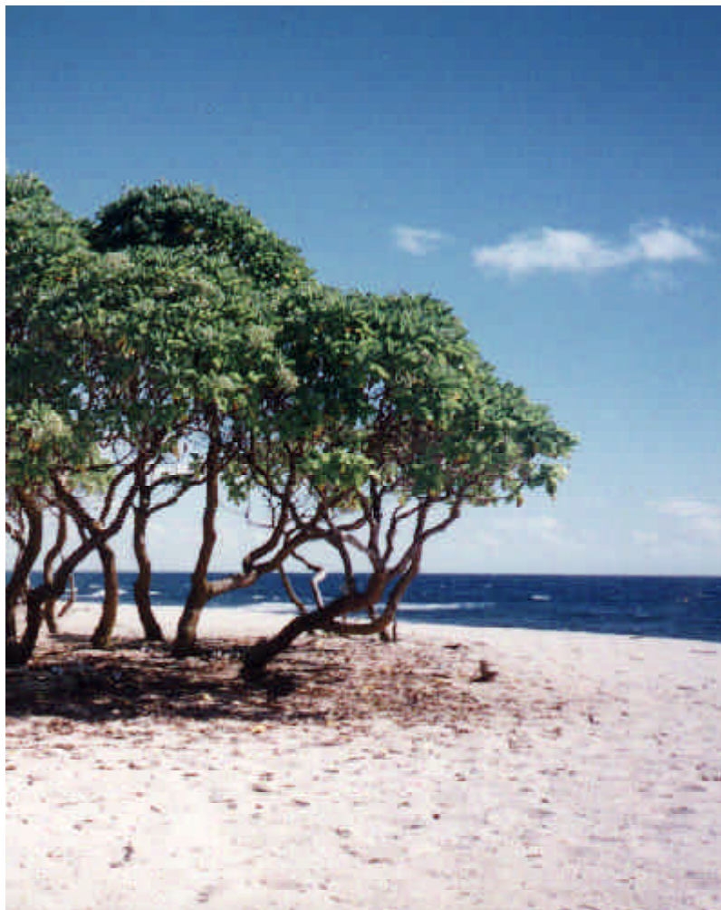
Environment needs to be integrated as a core aspect of any planning or policy decision.

environment alike and urgently needed attention.