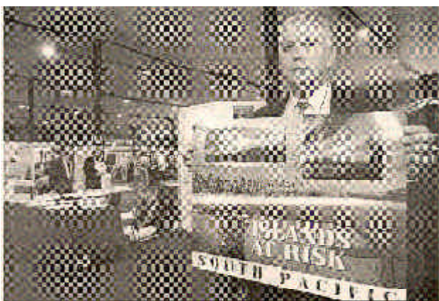
That sinking feeling: Terry Gee, minister of agriculture and fisheries of Niue in the south Pacific, displays a poster at the UN Convention on Climate Change in Buenos Aires yesterday to publicize the plight of small and largely flat island nations which fear that rising waters, due to global warming, will wipe them off the face of the earth.

During all the climate change discussions, the Pacific has consistently showed its skills in cooperation. Over the next two years, that capacity to cooperate will be much needed. Given the detail of the workplan agreed at Buenos Aires, the only way the region can hope to cover all the issues to be discussed in the many workshops will be to share the workload. Fortunately, cooperation and sharing are skills which the Pacific has in abundance.