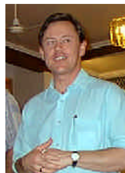
Hon. Simon Upton, NZ Minister of Environment and Chair of CSD7 visiting SPREP.

Sustainable development in the region must make the explicit links between health, population and the environment. Marine resources and freshwater supplies were critical to survival of people and