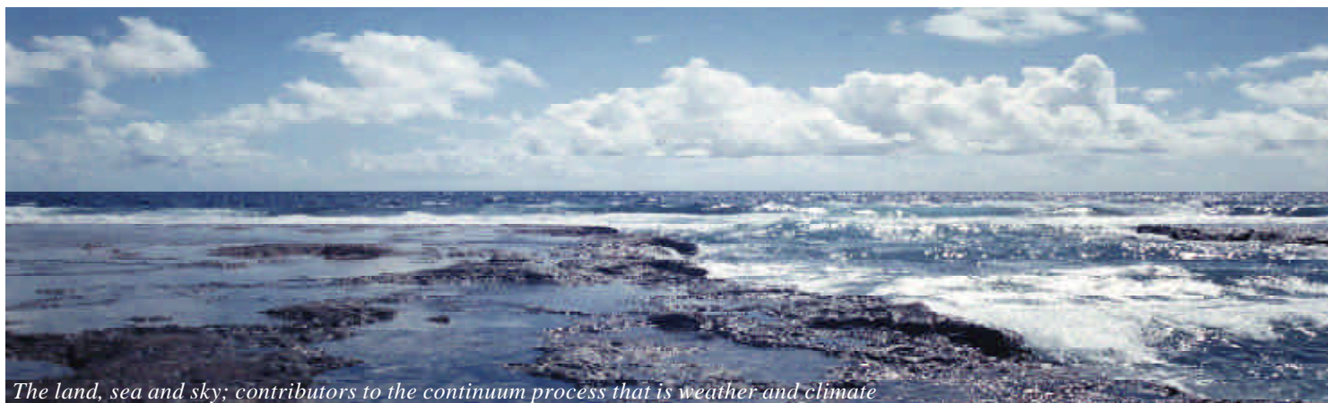
The land, sea and sky; contributors to the continuum process that is weather and climate