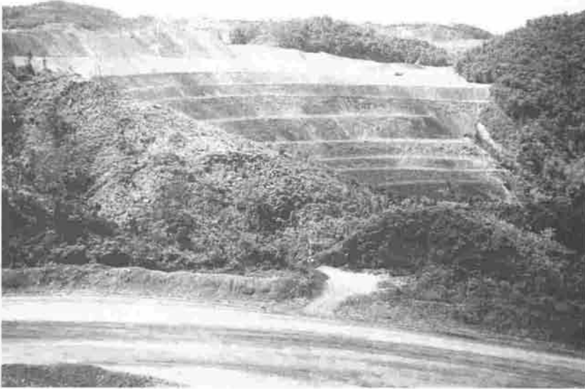
Plate 5 A mine pit engineered for reclamation.