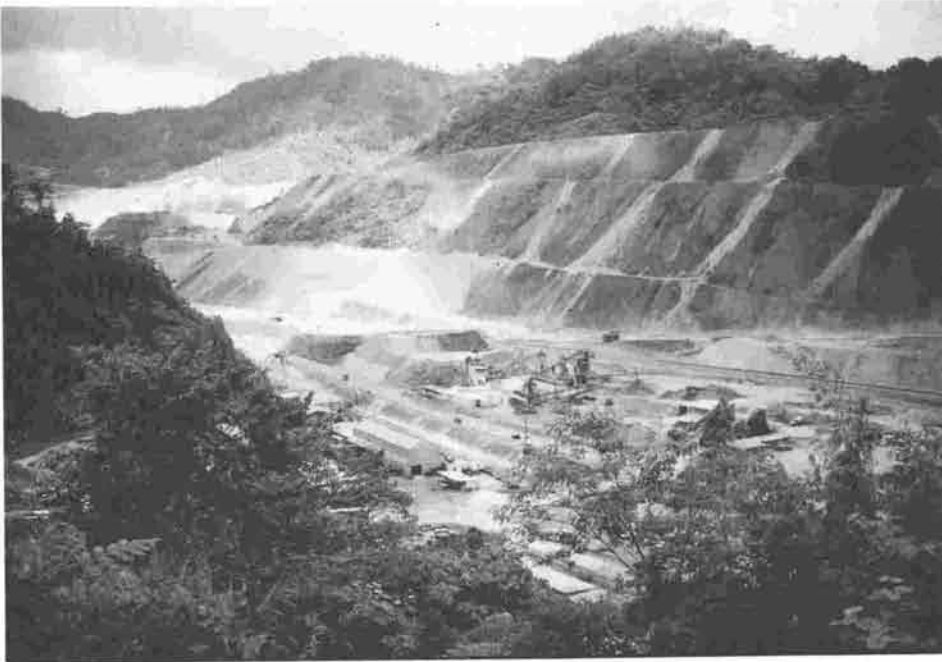
Plate 2 A mine pit in an interior valley has removed land from other resource use at least temporarily.

Plates 2 to 4 show how the pit at Bougainville Copper Mine (PNG) is situated within a valley, with tailings discharged to a river. The Bougainville mine produced 80,000 tonnes of waste rock and 120,000 tonnes of tailings each day. Plates 5 and 6 show a smaller mine, extracting gold and silver, producing 15,000 tonnes of tailings per day.