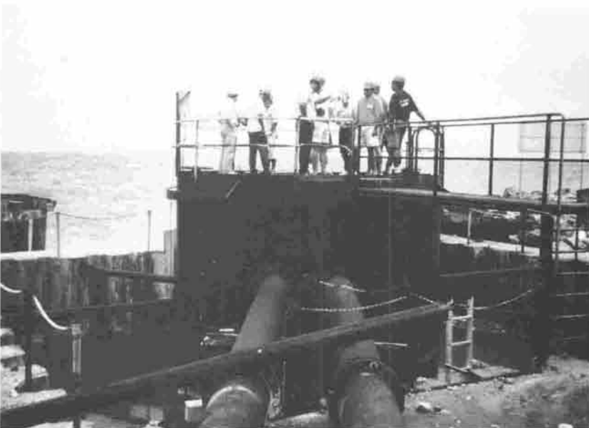
Plate 6 A seawater-mix de-aeration tank for submarine tailings discharge.