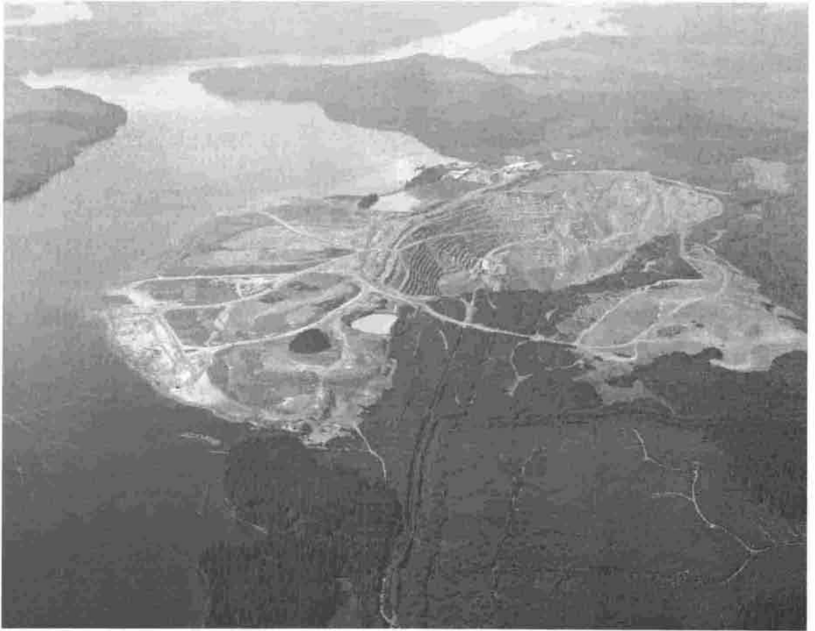
Plate 1 Island Copper Mine, Rupert Inlet, British Columbia, Canada