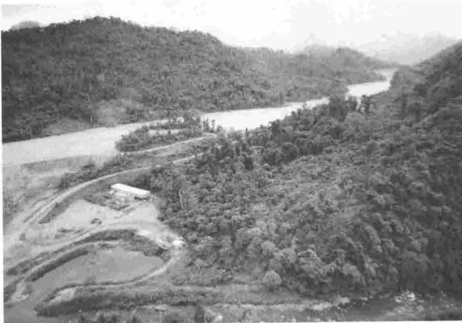
Plate 3 A river has been used for tailings discharge, and the flow completely fills the valley.