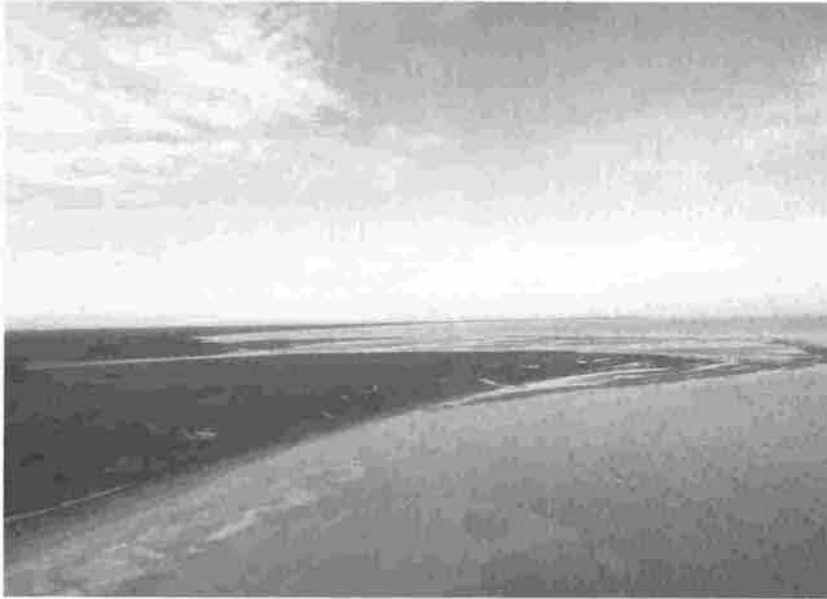
Plate 4 At the sea edge. Without an engineered outfall discharging to depth (see Plate 6), tailings will spread and have a significant impact on the coastline.