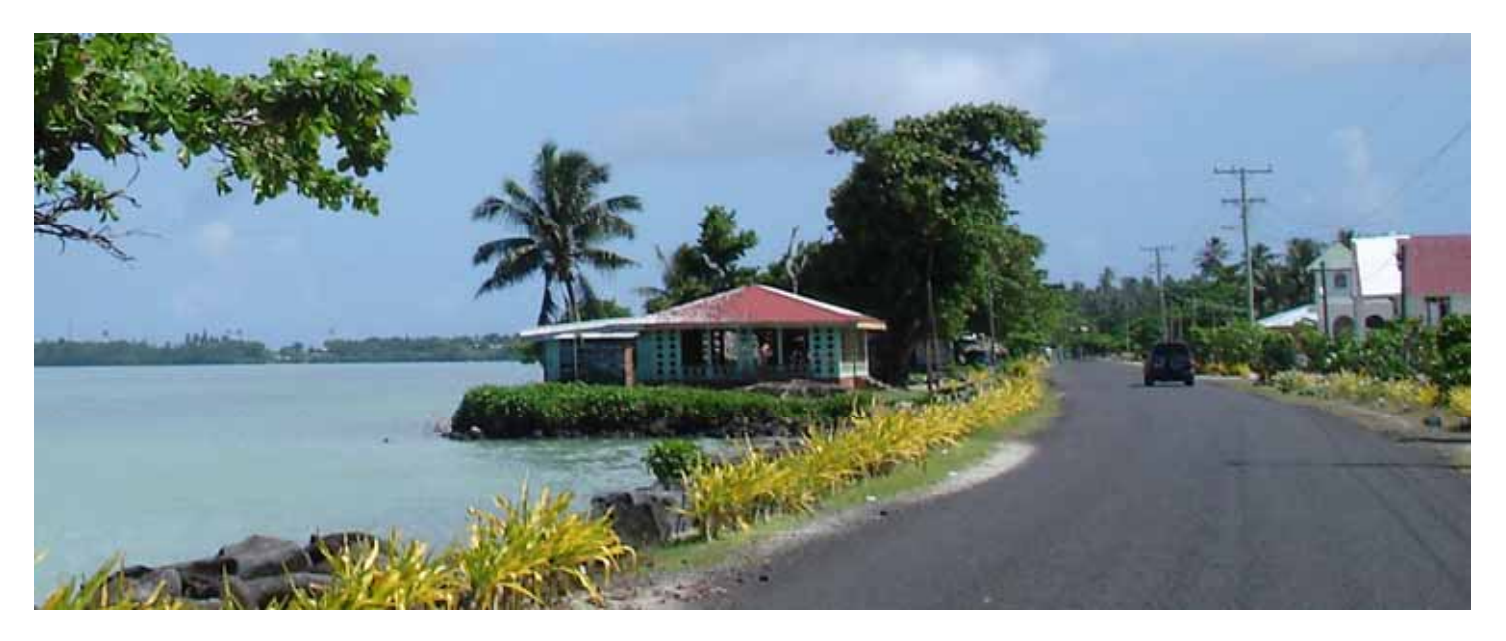
Satitoa looking south 10 December 2005 and 2 October, 2009