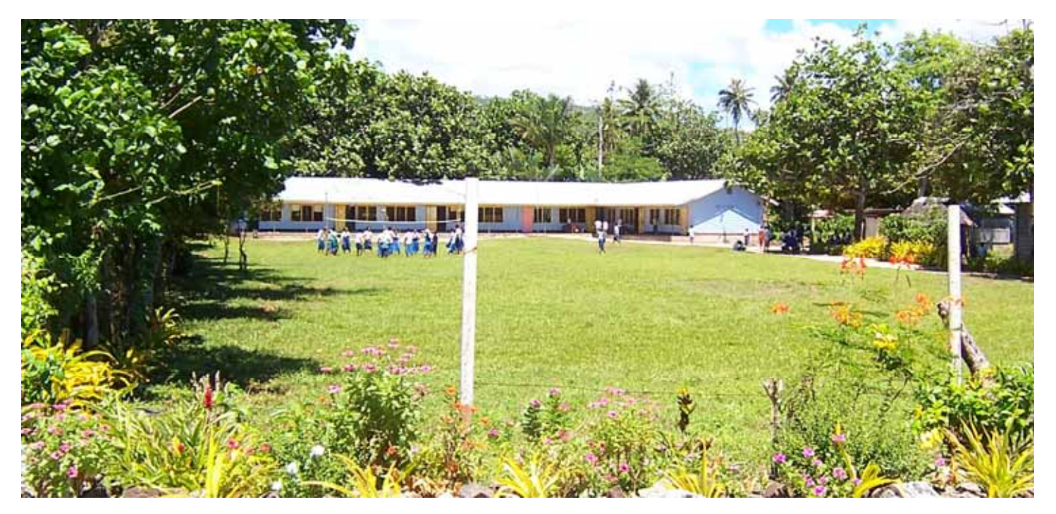
Ulutogia school 22 November, 2005 and 2 October, 2009