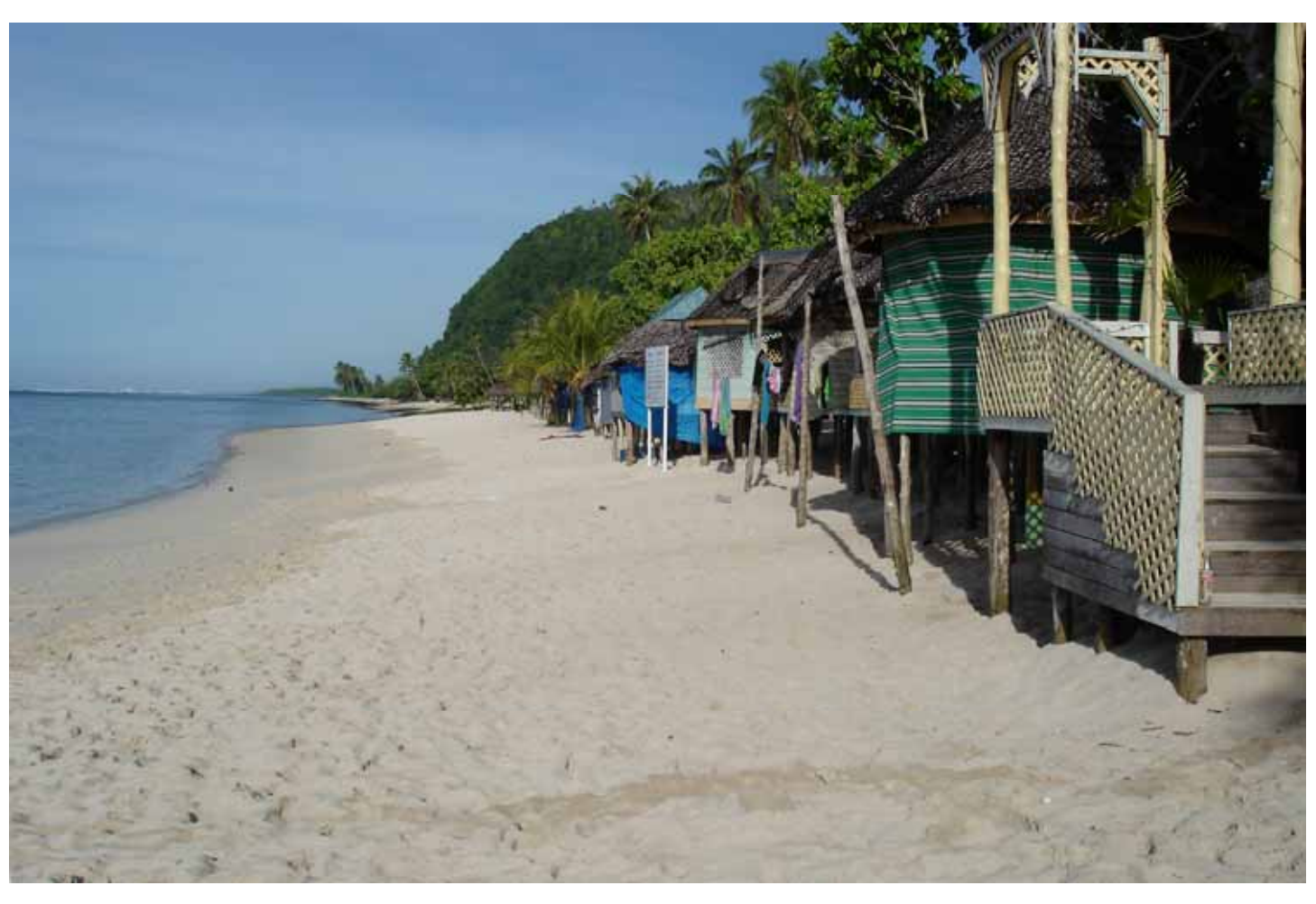
Lalomanu looking west 10 December 2005 and 2 October, 2009