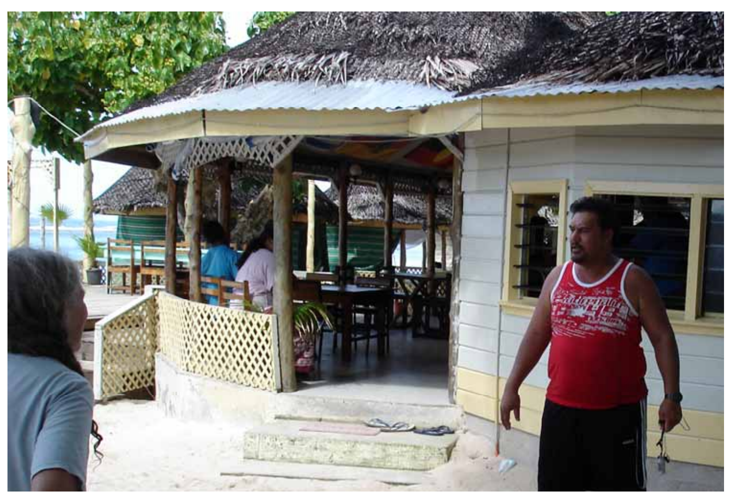
Lalomanu Taufua main centre with beach fales behind 10 December 2005 and 2 October, 2009