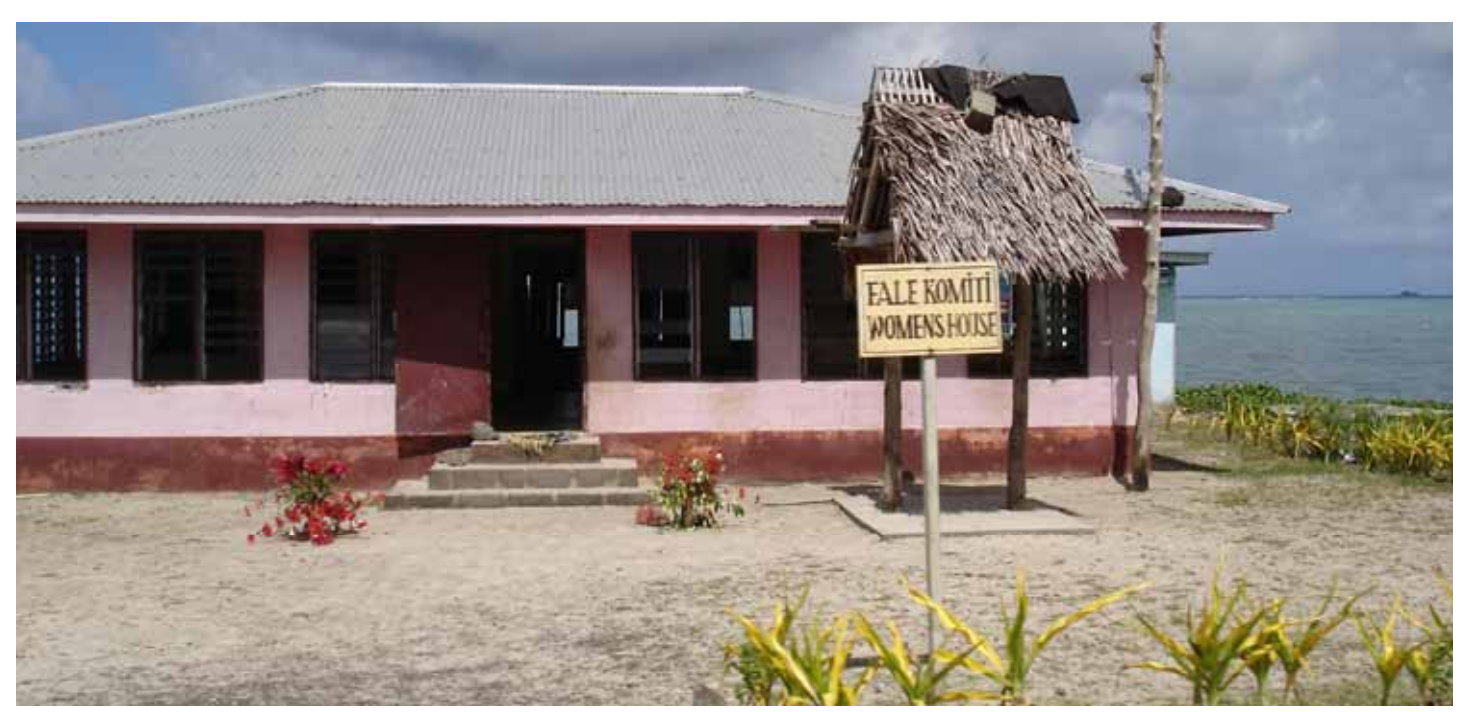
Ulutogia Women's Committee Centre 22 November, 2005 and 2 October, 2009