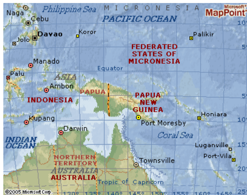
Figure 3: Regional Map of Australasia