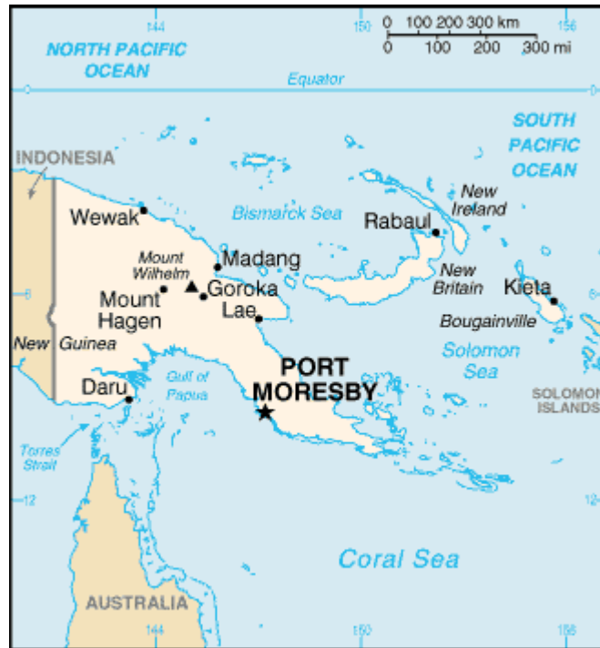
Figure 2: Map of Papua New Guinea