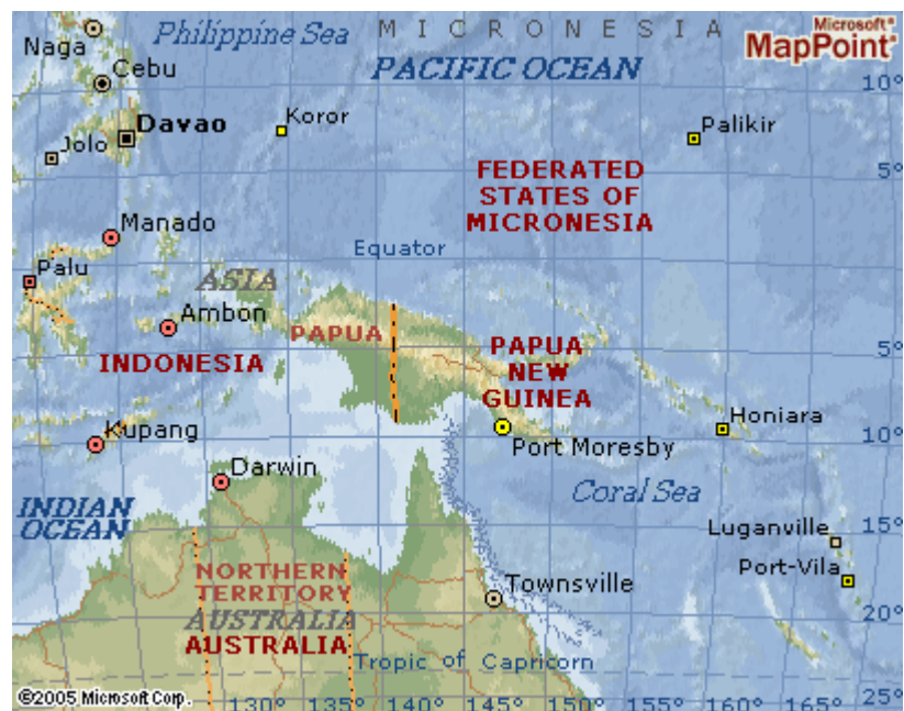
Figure 3: Regional Map of Australasia