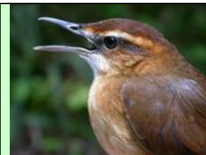
The Fiji Long-legged Warbler ( Trichocichla rufa ) was first collected in 1890. Four specimens were collected

One assessed bird is recorded as Extinct in Fiji: Nesoclopeus poecilopterus . One plant species is listed as Extinct: Weinmannia spiraeoides . The Fiji Long-legged Warbler (see below) was thought to be Extinct, but recent sightings have confirmed otherwise.