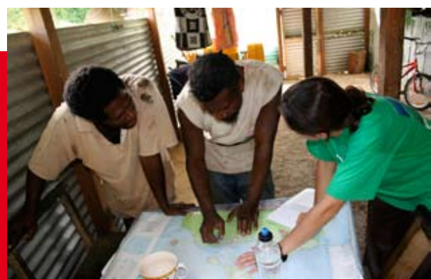
Gathering fishing location information in Emua village as part of socioeconomic surveys.

This most recent visit built on support given to the project in February by Government agencies and village representatives. The project is part of the Coral Reef Initiatives for the Pacific programme and is led by the Noumea-based Institut de Recherche pour le Developpement and supported by SPREP.