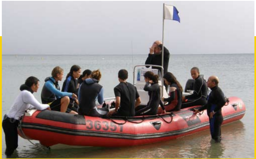
Part of the Lycee du Grand Noumea 'challengecoralreef' team ready to survey their project site.