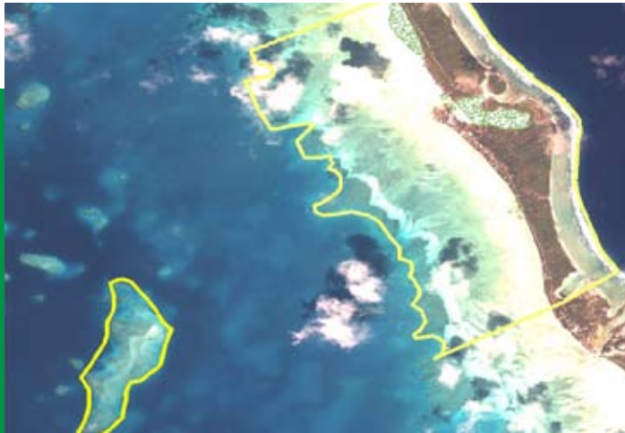
Map of Noto Village in North Tarawa, Kiribati - site of the proposed Ramsar Site.