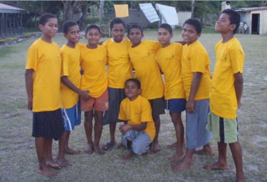
Namamanuca Primary School 'challengecoralreef' team in their competition uniforms.

S hore clean ups and acquiring new reef monitoring skills has helped students of Namamanuca Primary School in Fiji garner support from their community elders for protecting part of a reef surrounding their island.