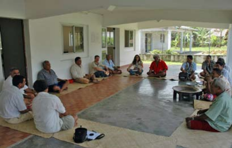
Ceremonie kava chefferie Sigave.