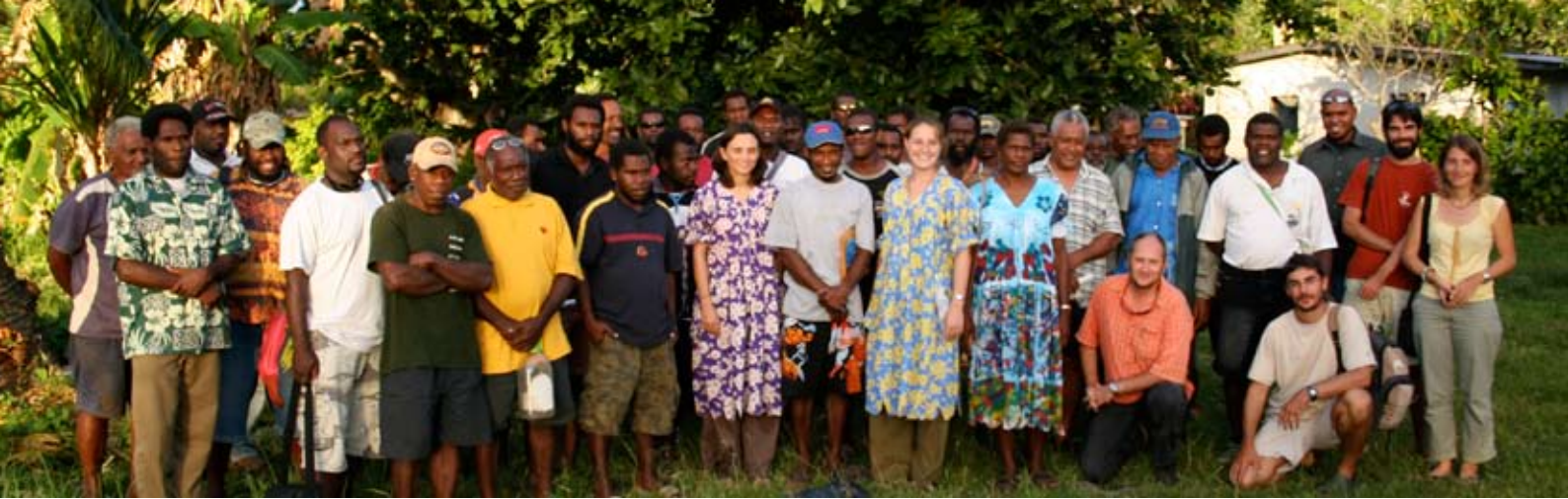
The socioeconomic and marine resources survey teams.