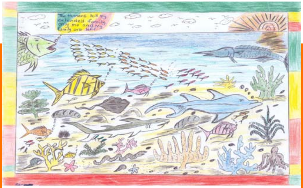
The winning poster in the 'Legends of the Reef' competition by Benagio from Vila East School in Vanuatu.