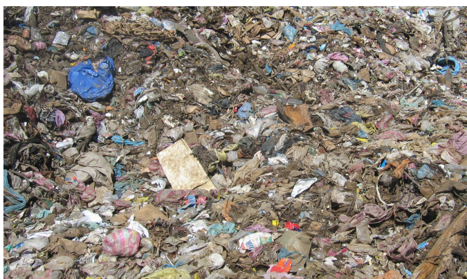
Those plastic bags in our landfills will be present for up to 1,000 years.

Hundreds of thousands of sea turtles, whales and other marine mammals die every year from eating discarded plastic bags mistaken for food. Turtles think the bags are jellyfish, their primary food source. Once swallowed, plastic bags choke animals or block their intestines, leading to an agonizing death. On land, many cows, goats and other