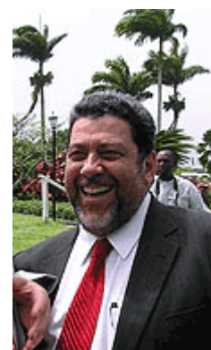
Dr. Ralph Gonsalves, Prime Minister of St. Vincent and the Grenadines

The planned strategies include the promotion of healthy lifestyle practices by individuals, communities and national populations and the adoption by the governments of the region of public-policy measures that are conducive to wellness and well-being.