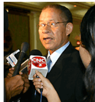
Mr. Bruce Golding, Prime Minister of Jamaica, at Press Conference

Mr. Golding emphatically reaffirmed his commitment to Caribbean regionalism when he told his colleagues at the special Summit on chronic noncommunicable diseases (CNCDs): "The Jamaica delegation is fully supportive of the Declaration of Port-of-Spain ," which was later approved unanimously by the representatives of all Caribbean states.