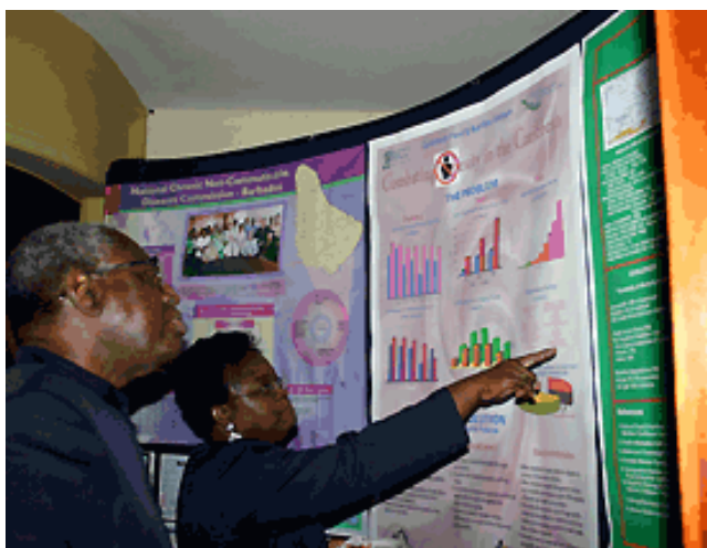
President Runaldo Ronald Venetiaan of Suriname and Colleague View Posters from the Caribbean Food and Nutrition Institute (CFNI) on Prevalence of CNCDs in the Caribbean