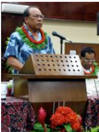
Figure 5: The President of the Republic of the Marshall Islands facilitating the National Water Summit in 2011

Prior to commencement of IWRM there was limited cross sectoral engagement or communication on water issues. The project aimed to increase engagement, with a particular emphasis on strengthening communication between national government and traditional community-based governance arrangements. The National IWRM Task Force established the forum for this and, with Secretariat support for this group provided through the IWRM, up to 30 different agencies from national and local government, representatives of NGOs, and community leaders have met on a quarterly basis to discuss national water and sanitation policy and IWRM planning, review the status of various water related investment in the Marshall Islands, and to share information on the results of various stress reduction technologies being trialed as part of the IWRM demonstration project. Minutes of the meetings of National IWRM Task Force indicate a high level of continuity of participation by senior representatives of the participating agencies in these meetings.