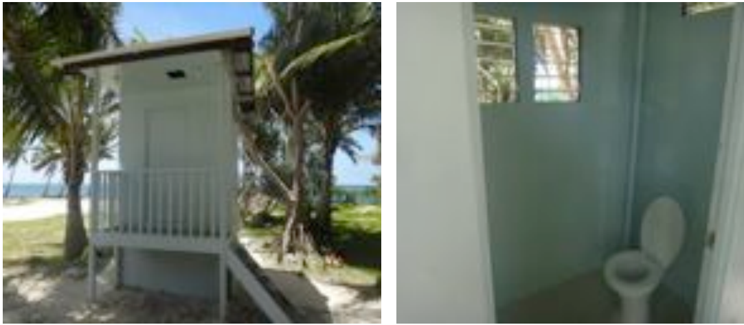
Figure 14: Recently constructed eco-san toilets as part stress reduction methods and ideal replacement for current toilets being used on Laura