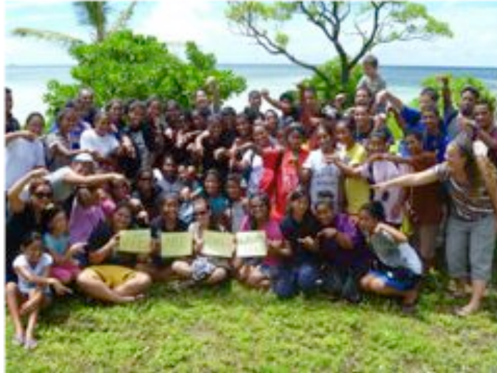
Figure 7: Community awareness workshop on IWRM and safeguarding the Laura lens convened as part of the IWRM demonstration project's outreach programme