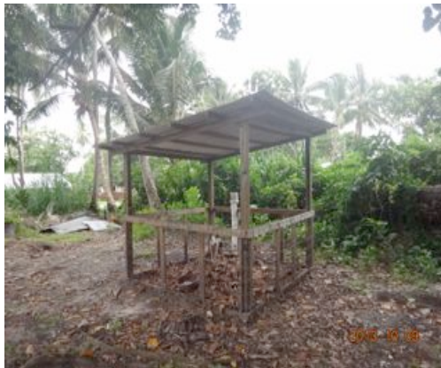
Figure 12: Waterless dry litter pig waste management being promoted in the Laura community at commercial pig farms and for household pig pens (change photos above to include Bokmej and household pens