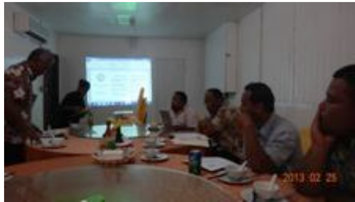
Figure 9: Council members discussing issues relating to use of septic systems in areas of the vulnerable Laura groundwater lens

The Majuro Atoll Local Government (MALGOV) ordinances human and pig waste management and the RMIEPA regulations for household toilets require the use of septic systems at each household in the Laura community. Limited resources for septic pump-out and disposal had led to overloaded septic systems contaminating the Laura water lens. The project demonstrated alternative, locally appropriate technologies for the management of pig-waste (dry-litter pig pens) and human waste (ecosanitation composting toilets) in the Laura community. The Laura lens committee for the project has initiated efforts with MALGOV and RMIEPA to amend local government ordinances and national regulations to encourage the use of dry litter pig pens and ecosanitation toilets in place of septic systems.