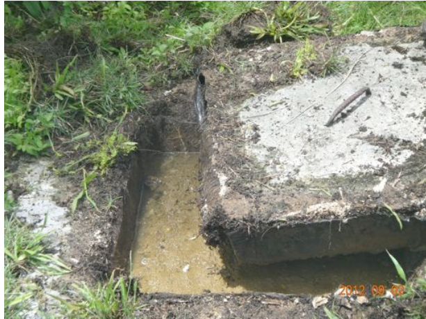
Figure 10: Example of an overloaded septic immediately above the Laura Water Lens