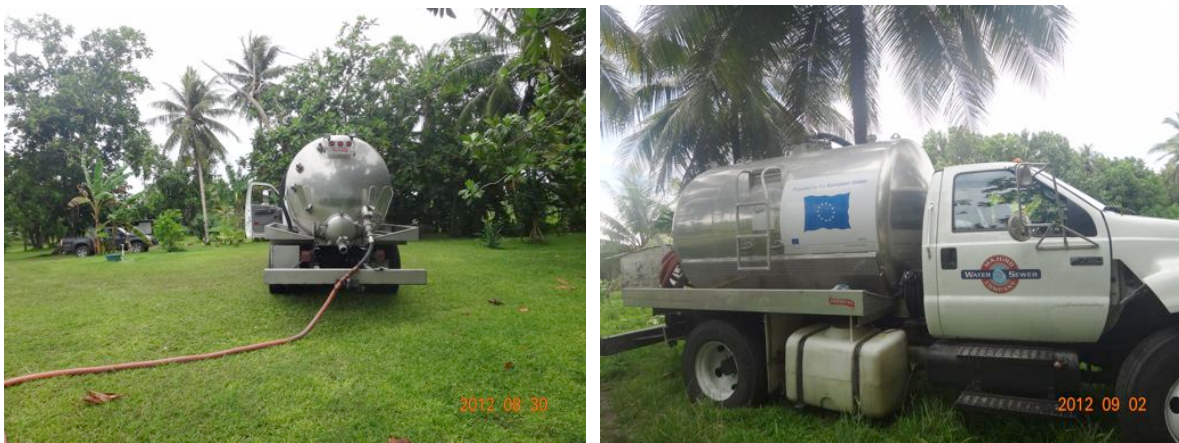
Figure 15: The Majuro Water and Sewer Company septic pump-out operations

Prior to inception of the IWRM demonstration project there was no monitoring of the status of sanitation systems in the Laura community. Routine monitoring of well water quality and resultant e-coli data had indicated significant risk of waterborne disease. Priority targets of the project were to conduct an assessment of the state of sanitation at the project site and to initiate a monitoring programme to identify septic system remediation and sludge disposal needs. Based on the results of this assessment, the project initiated a partnership with the Majuro Water and Sewer Company for the routine pump-out of septic systems. To date this has resulted in almost 40 percent of overloaded septic systems having been remediated. Recent surveys of well water quality indicate significant reduction of e-coli in the Laura lens groundwater. This has been augmented with efforts to promote ecosanitation approaches within the community.