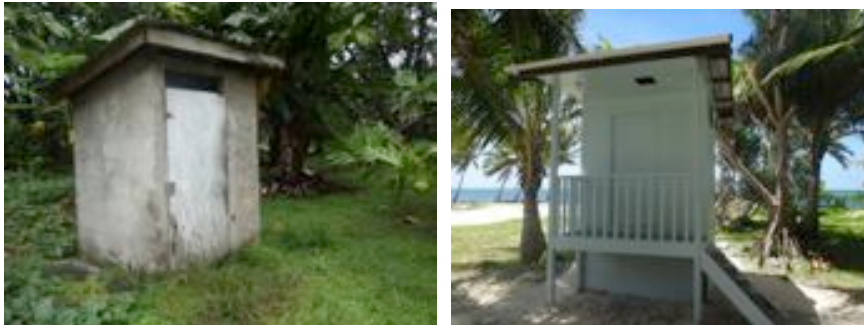
Figure 16 Comparison of the commonly used flush toilet in Laura with the waterless composting toilet demonstrated in the Laura community

householders in the Laura community of how to reduce household water use by 30 percent through the use of ecosanitation composting toilets. Technical exchange with the Tuvalu IWRM project enabled the construction of 3 demonstration toilets at key locations within the Laura community. It has been estimated that these households have reduced water use by 40 percent through the use of composting toilets instead of flush systems. These reductions in water use have been augmented by the conversion of wash-down pig pens to waterless dry litter pig waste management systems at 30 households in the community.