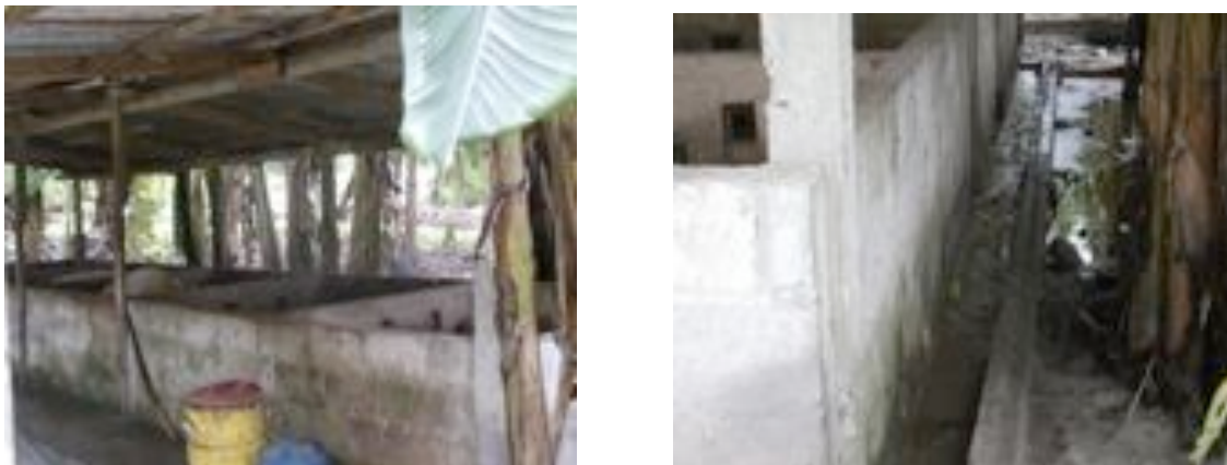
Figure 11: Commercial piggery situation above the Laura Water Lens with effluent discharge into cesspit immediately in the lens. High levels of e coli have been recorded at wells in the vicinity.

At the time of project inception, there was no action underway for reducing pollution discharges into Laura groundwater. The target of the project is to achieve 30% reduction in sources discharging into Laura groundwater. To date the number of households and pollutant sources have been identified and characterized. Pollution from pig waste has been identified as a major source. Preliminary work has been done to remediate a large broken pig waste septic at a commercial piggery and conversion of its operation to a dry litter system, and conversion of 30 household pig pens to dry litter system from typical water intensive wash down pens. An ECOSAN pilot activity is also underway in the Laura community, with 3 pilot systems constructed at prominent locations in Laura community. The national IWRM Plan for RMI is being developed and contains targeted costed actions for pig waste management and ECOSAN replication and scaling-up.