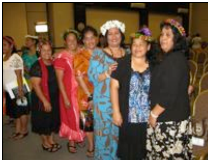
Figure 1: Influential female members of the community, including the First Lady, Government Officials, and WUTMI members attend the 2011 Water Summit to lend their support to IWRM initiatives in RMI

Prior to project inception a consultant had been engaged to identify IWRM and WUE needs for the Marshall Islands. Although these had not been considered by communities or relevant agencies of government. The target was to have the approach defined and endorsed by national APEX body. Via the operation of a national consultation process, involving communities and women’s groups, priorities for and steps towards institutionalizing IWRM approaches in the RMI have been developed and endorsed by the National IWRM Task Force.