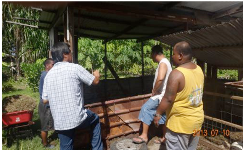
Figure 6: Members of the Laura Lens Committee meeting with a regional expert on pig waste management to discuss and plan the installation and maintenance of dry litter pig pens in the Laura Community

At project inception there existed no mechanism for local community stakeholders, including landowners and traditional leaders to contribute to planning and management of water resource use and sanitation in the area of the Laura groundwater lens. The target of the project was to establish a local coordinating committee to enable community input to planning at both local and national levels and to establish a formal linkage between local stakeholders and the National IWRM Task Force. Terms of Reference and membership for a Laura Lens Integrated Water and Land Management Advisory Committee (or Laura Lens Committee) were developed, considered by the 2011 National Water and Sanitation Summit, and subsequently endorsed by the Chair of the National IWRM Task Force. The Committee has been in operation since 2011 and acts to guide planning of local stress reduction initiatives and provides inputs to national policy and planning.