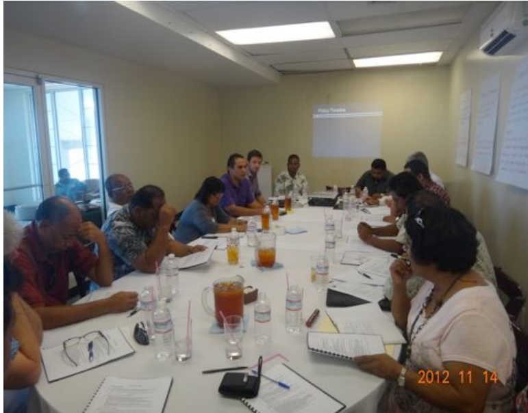
Figure 2: Members of the National IWRM Task Force working to incorporate agreed approaches for IWRM into the National Water and Sanitation Policy