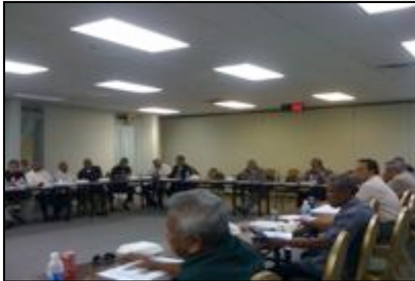
Figure 4: National IWRM Task Force making a presentation to RMI Parliament on IWRM Policy

and traditional leaders, national government departments, local governments, private sector and NGOs. The Task Force is actively leading coordination, policy development, and planning.