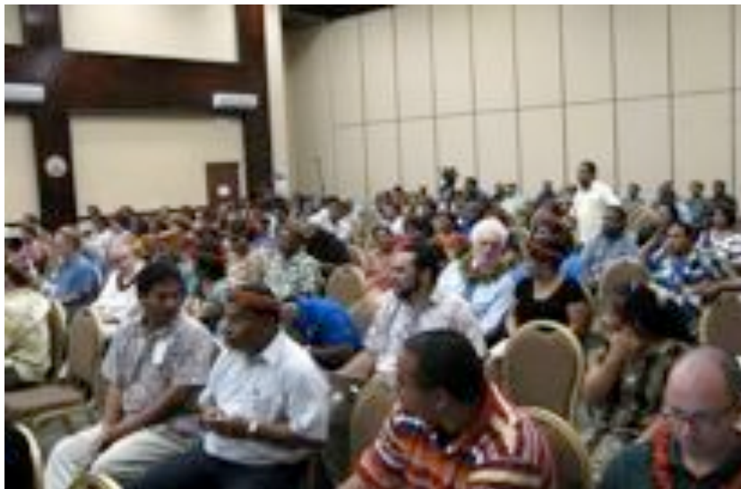
Figure 3: Community representatives participating in a National Water Summit in 2011

At the time of project inception, the relationship with the Laura community and national government was tenuous due to a history of dispute over water resource access and allocation. Prior to project commencement, only 2 community group representatives occasionally took part in government workshops. Regular engagement of traditional leaders, landowners, and Laura residents with government through the operation of the community-based Laura Lens Committee has assisted with developing a common understanding and trust between the community, with on average 12 community leaders meeting on a quarterly basis with government.