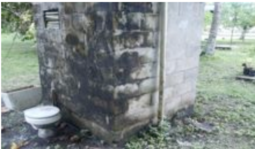
Figure 13 Current toilets being utilized at Laura providing poor sanitation and septic systems