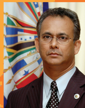
ASSISTANT SECRETARY GENERAL Albert Ramdin