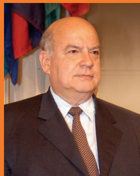
SECRETARY GENERAL Jose Miguel Insulza