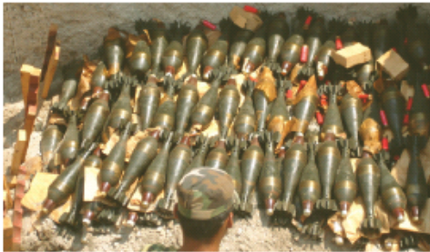
"Operation to destroy munitions stockpiles."

The OAS made important strides during 2007 in its task to remove thousands of landmines that posed a threat to civilians in countries affected by conflict. Over 7,390 mines were destroyed and more than 313,800 square meters of land were cleared in Nicaragua, Ecuador, Peru, and Colombia.