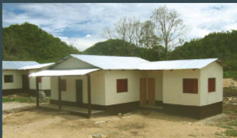
"The OAS integrates sister communities".

The nations of the Hemisphere are continuing their robust efforts to renew and strengthen democratic governance. Through its Secretariat for Political Affairs, the OAS carried out several special missions to address specific situations and political-institutional crises in the region. The Secretary General continued to lend his support to the efforts of the Government of Ecuador to promote the stability of the democratic system and to proceed with the Constituent Assembly process.