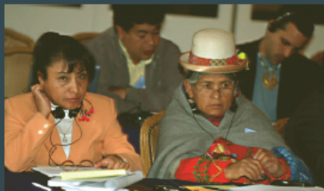
"Ensuring effective participation."

During this period, the Commission carried out a series of visits to different countries of the region. The Commission issued its report Access to Justice and Social Inclusion: The Road Towards Strengthening Democracy in Bolivia , and with respect to the situation of human rights and the demobilization process in Colombia, it published its Report on the Implementation of the Justice and Peace Law: Initial Stages in the Demobilization of the AUC and First Judicial Proceedings .