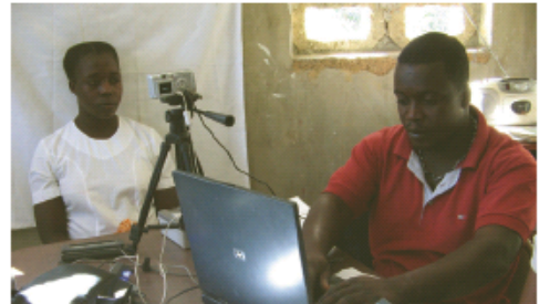
"The OAS registers 4, 2 million citizens in Haiti."

Through its Scholarships Program, the Secretariat has made a significant effort to promote and develop human capital in the member states. A new Manual of Procedures for the Scholarship and Training Programs of the OAS was approved in 2007. It is designed to make the program more transparent, accountable, and objective. Two selection processes were conducted resulting in the selection of nearly 500 students eligible for scholarships.