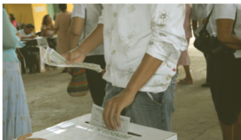
"The OAS promotes the stability of the democratic system."

Also, numerous electoral processes were carried out in the region, which the OAS accompanied with eight electoral observation missions in six of its member states. More than 650 observers and experts on electoral matters took part in those missions. At the same time, work continued on the standardization of the criteria and methodology used for such missions. In October 2007, a manual was published detailing, for the first time, the legal principles applied by the observers in the performance of their duties. The gender factor was also applied to the observation missions, in accordance with General Assembly mandates calling for greater gender balance in all OAS bodies.