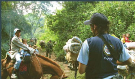
"OAS Special Missions support the strengthening of governance in the region."