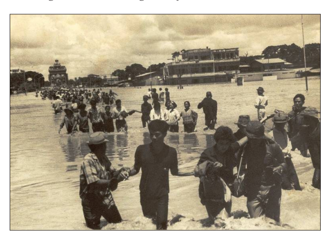
Pedestrians are help to cross the flooded Lange Xiang Avenue.