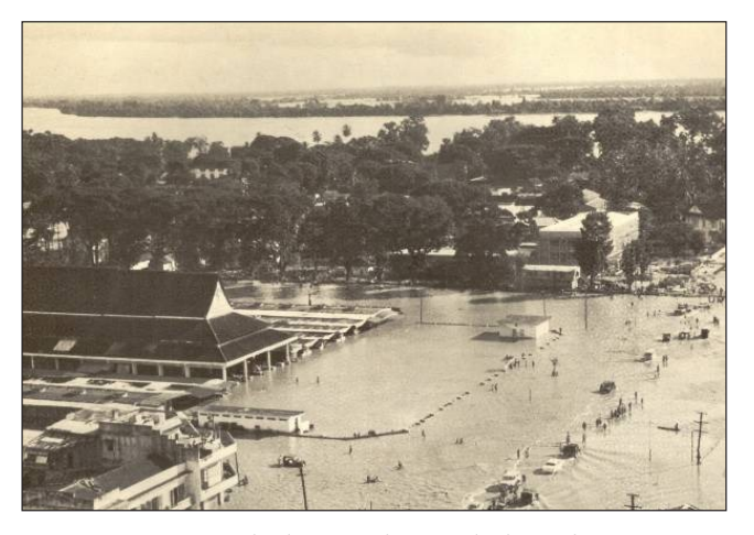
Lang Xiang Avenue looking south towards the Mekong.