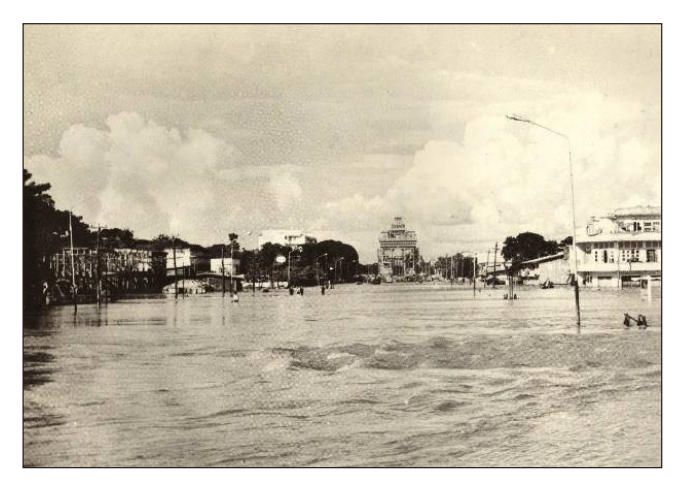
Lang Xiang Avenue.