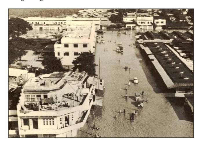
The Morning Market