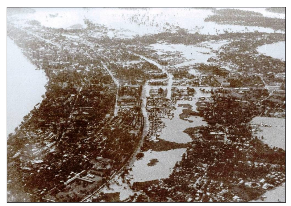
Central Vientiane September 3rd, 1966.