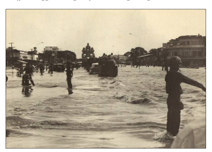
Soldiers direct traffic on Lang Xiang Avenue.