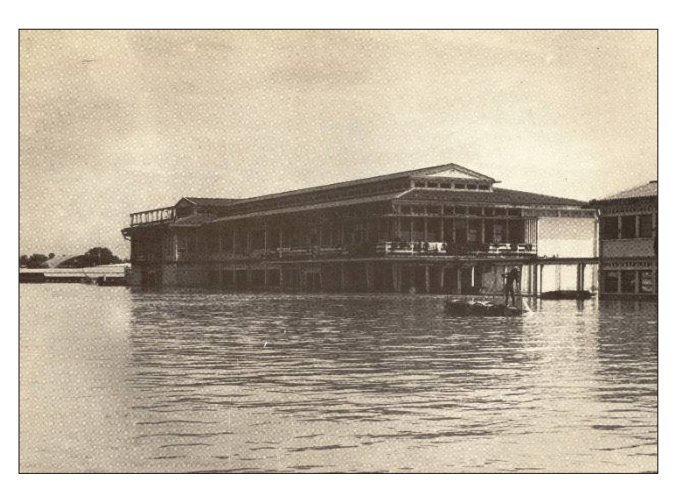
The terminal building at Wattay Airport.