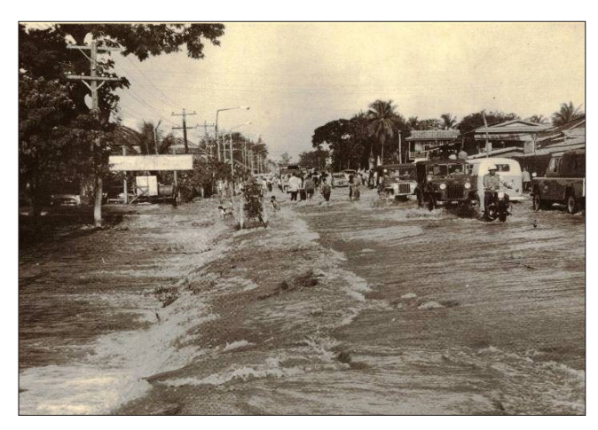
High water velocities added considerably to the infrastructure damage.