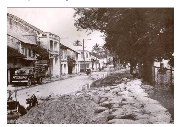
Sandbags were laid to protect the river banks.