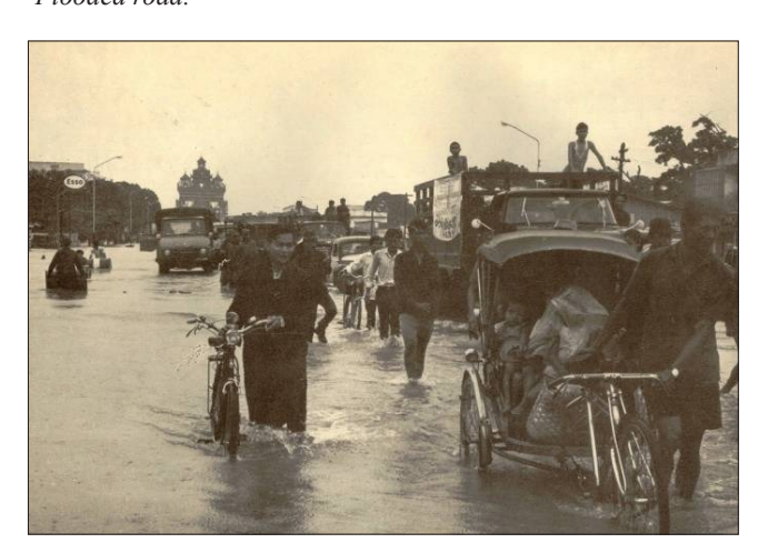
Traffic struggles along the flooded Lang Xiang Avenue.