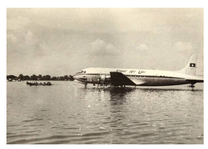
The runway at Wattay Airport with a stranded Dakota.