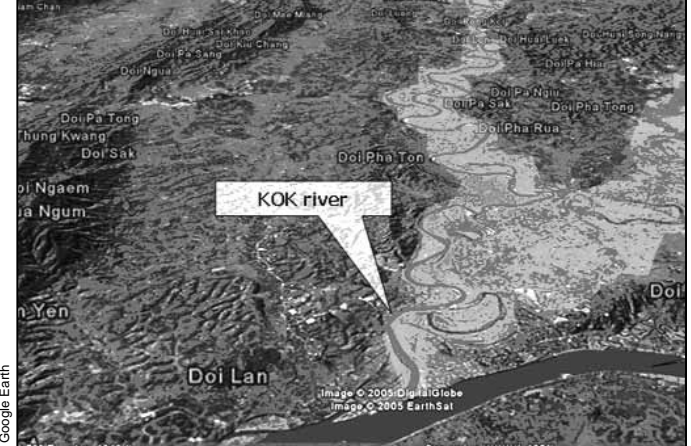
Lower Kok River Basin - the pale grey area shows approximate area flooded in 2005.

The Thai DWR will initially undertake topographic and hydrographic mapping as well as GIS