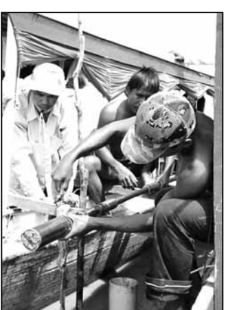
The team collects a core sample from the bottom of the Great Lake in Cambodia.

Sediment at the bottom of the lake is soft and this, combined with windwave induced water movements at the lake bottom, needs to be taken into account when planning such a channel. The tendency for such structures to fill in is more noticeable in the low water period when the water depth in the lake is only one to two metres.