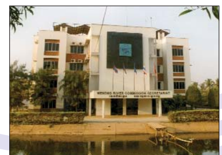
The Cambodian HQ saw many successes.

In July this year the MRC established a Flood Management and Mitigation Programme, which will become one of its new core programmes and will be housed in a new Regional Flood Management and Mitigation Centre in Phnom Penh. ~