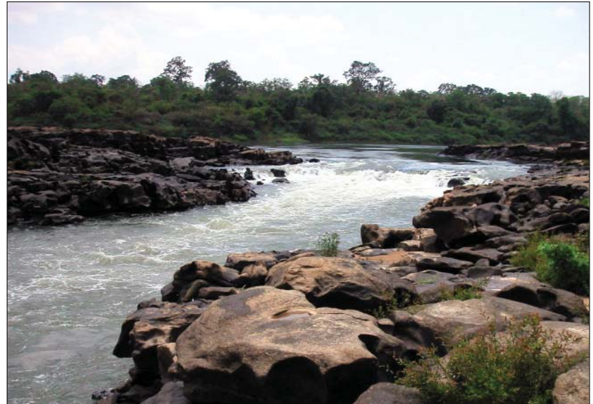
Sharing environmental knowledge is a good way to help keep the river healthy.

Over future months fisheries and environmental experts from the MRC will help provide data on such topics as the population, migration and spawning of the giant Mekong catfish, the fate of the Irrawaddy dolphin and vital watersheds needing protection or restoration. Studies on the latter started in four pilot sites in