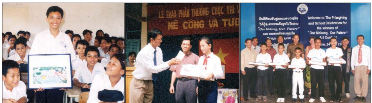
Below, from left: Winning students from Cambodia, Vietnam and Lao PDR all had a chance to share in the fun of a school celebration.