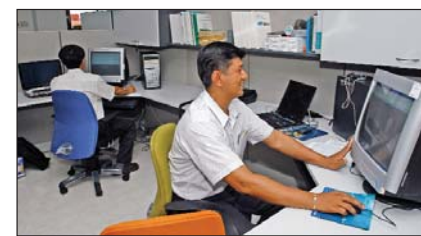
Thailand provided new office furniture.

The Vientiane building has been provided by the Government of Lao PDR. The new headquarters agreement was formalised in a signing ceremony in Vientiane on June 14, 2003 attended by Deputy Prime Minister of Lao PDR H.E. Asang Laoly.