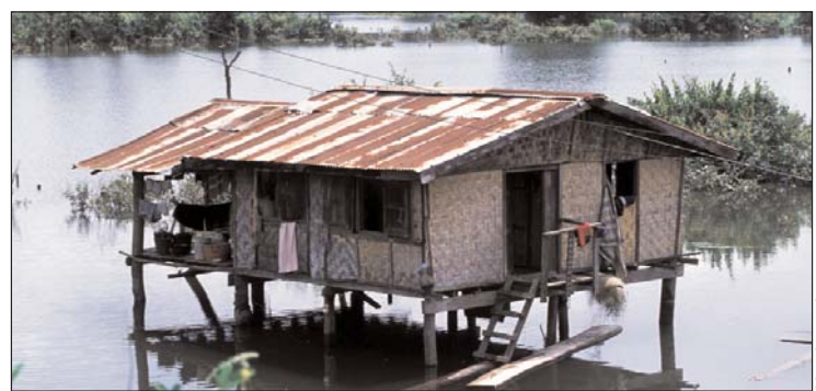
Early warning of possible floods can help local people prepare to cope.

AHNIP is now building a new station 6km south of the China Lao PDR border at Houakhong, which will monitor the river immediately as it enters Lao PDR. ~