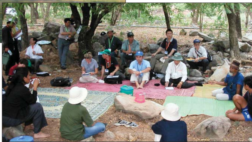
Tour participants take a break in one of the sites they visited in the countryside.

The BDP team sees this as a good omen for the future. "If planners can sit together and discuss sensitive issues it has to help improve the decision-making processes in each country through better understanding of each other's concerns," they said. ~