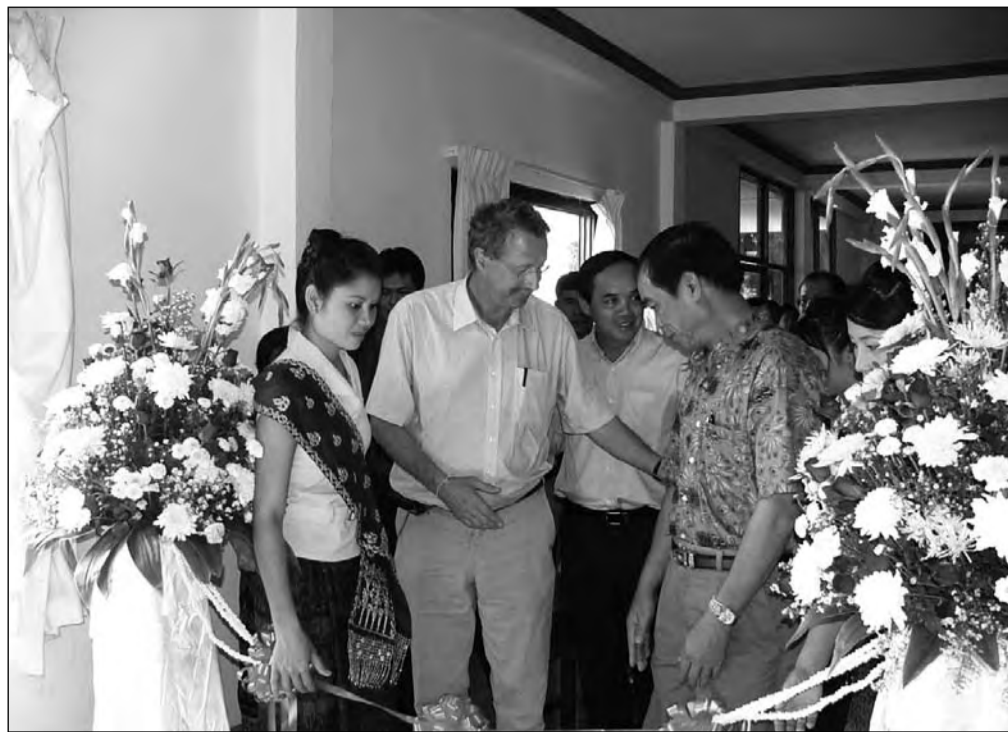
Local fishers play a vital part in the monitoring of species in the Mekong at all the monitoring sites throughout the basin

The offices can act as communication platforms for news, knowledge, and all kind of data on sustainable watershed management and it is hoped that they will become gathering points for all concerned with watershed management, eventually developing into more sophisticated watershed management centres. Local people, extension workers, and