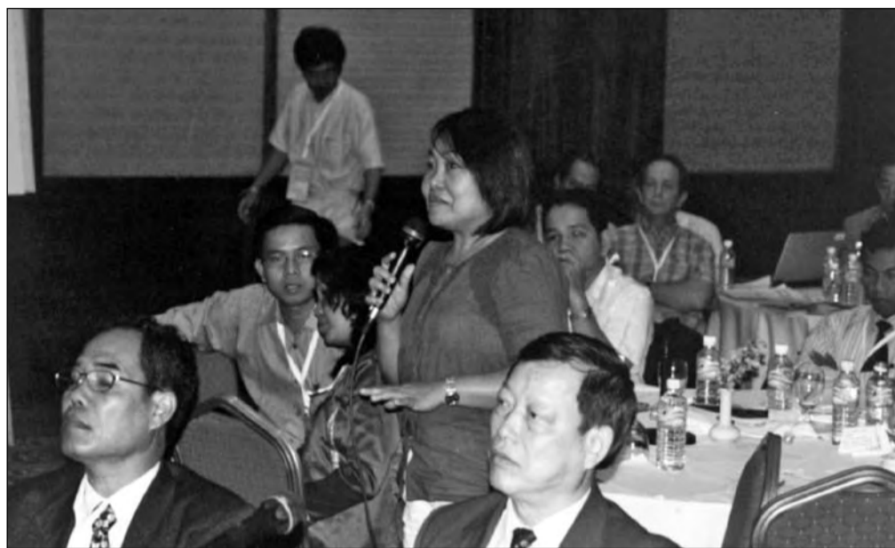
Representatives of many parts of society came to add their voices to the Basin Planning Process.

MRC staff pointed out that there are no magic solutions to the challenges facing basin decision makers. While research, monitoring and scientific modelling can provide much information on current situations, and on the possible effects of large individual projects such as storage dams, the cumulative effects of rapid development will affect rivers and the communities around them in ways that cannot be exactly determined. The BDP