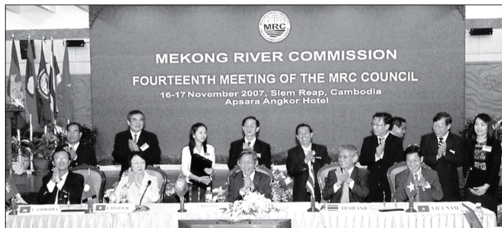
A good end to a good meeting as the minutes are signed in Siem Reap.

It was reported that in 2007 the MRC signed agreements worth over US$20 million to fund its programme work and this had enabled the MRC to develop a proposal for a new hydropower programme; to fully develop the Information and Knowledge Management Programme (IKMP); to build capacity in the MRCS and NMCs; and to continue work in basin planning, fisheries and the environment.