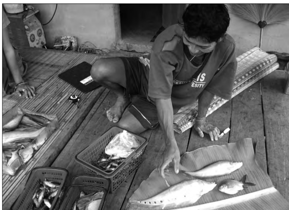
Local fishers play a vital part in the monitoring of species in the Mekong, at all the monitoring sites throughout the basin

Local fishers began monitoring the abundance and diversity of fish in June 2007 at 23 sites in four habitats (mainstream, tributary, flood plain and estuary). At each site fishers recorded their daily