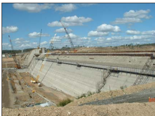
Figure 7. Fishway suitable for barriers over 6 metres (example of a lift fishway under construction on left side of spillway in the photo from Queensland, Australia)