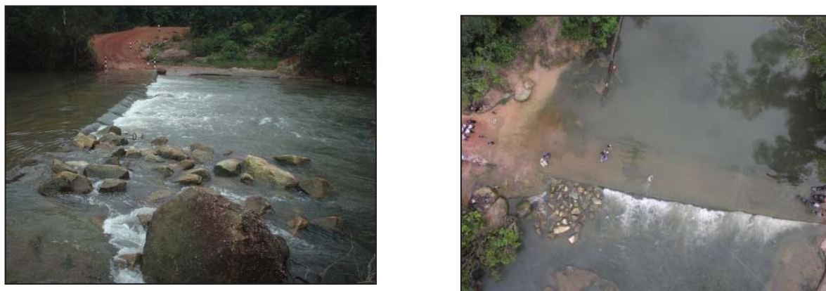
Figure 2. Fishway suitable for barriers up to 2 metres (example of a rock-ramp fishway in Phou Khao Khouay, Lao P.D.R.)

passage the greater the problems with fish not being able to ascend the fishway and then find their way through the reservoir upstream of the barrier. For larger barriers, knowledge of what would happen to any fish after using the fishway needs to be considered before deciding if a fishway would be effective.