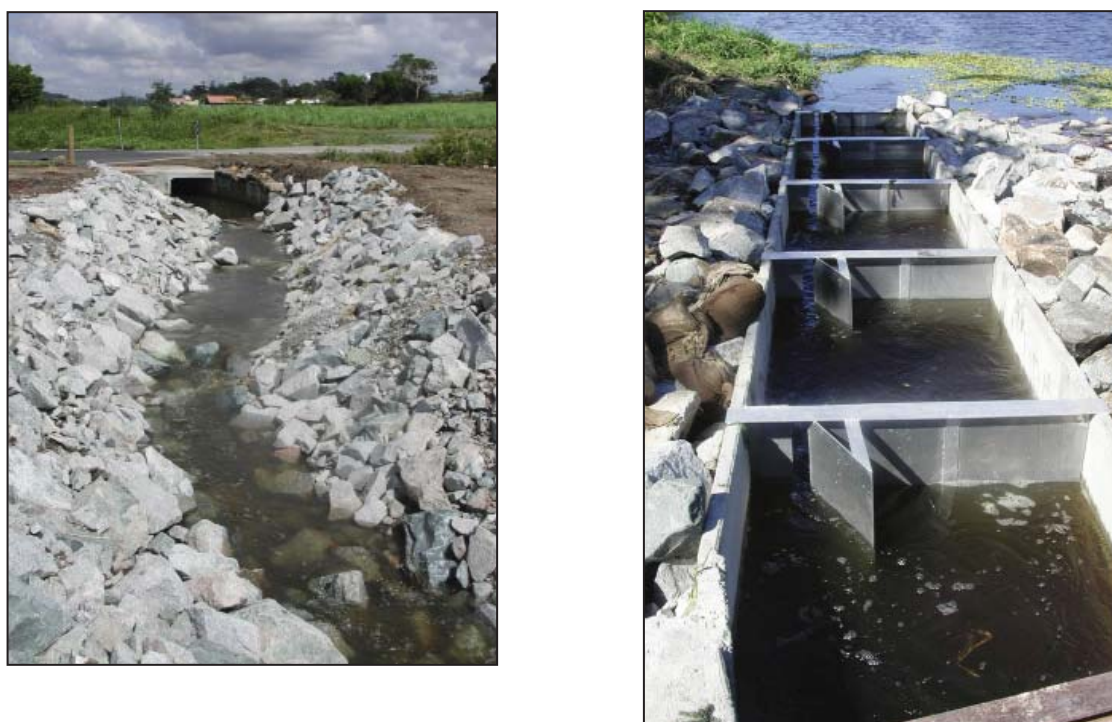
Figure 3. (left). Fishway suitable for barriers up to 2 metres (example of a bypass fishway in Queensland, Australia)