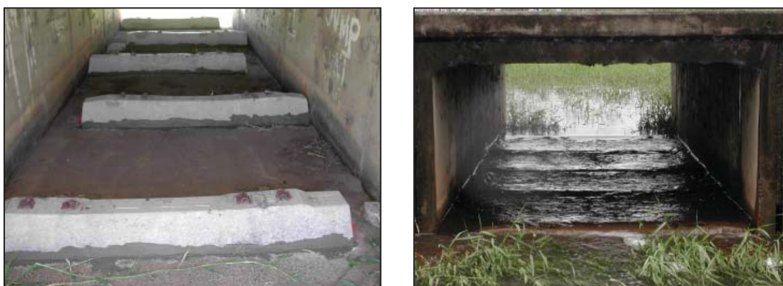
Figure 1. Fish-friendly designs for high water velocity barriers (example of a culvert design creating controlled water velocities and increased depth to facilitate fish passage in Queensland, Australia)

However, with increased understanding of local fish species swimming ability and behaviour, local design criteria can be applied and these general guidelines can be adjusted so the risk of a fishway design failing to provide fish passage can be reduced. However, the higher the barrier to fish