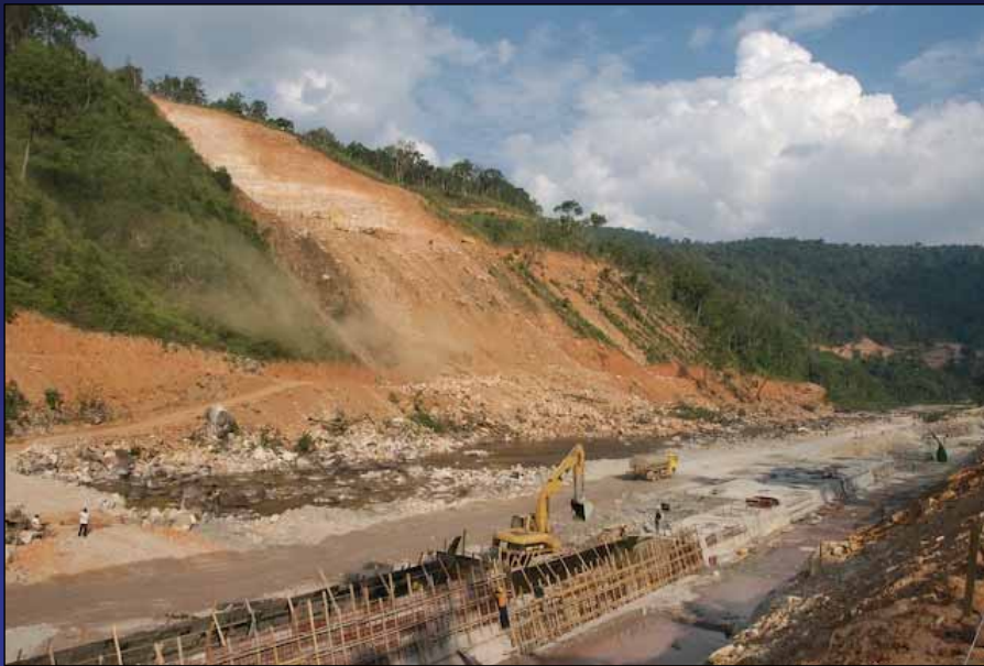
Kamchay Dam, Cambodia