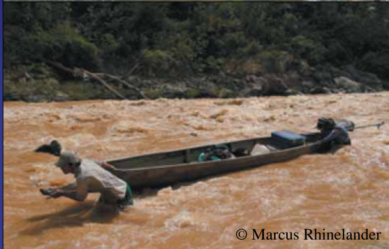
Sekaman River, March 2004 and 2008