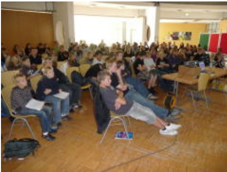
Pupils of the comprehensive school in Bergstedt