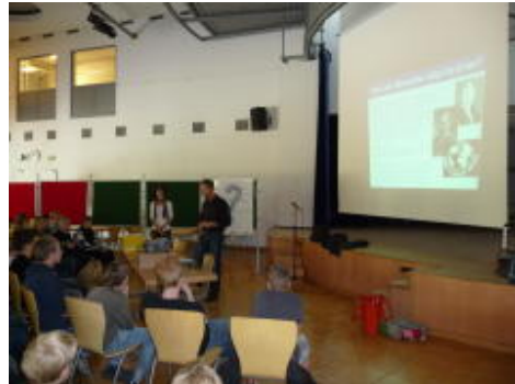
Pupils of the comprehensive school in Bergstedt