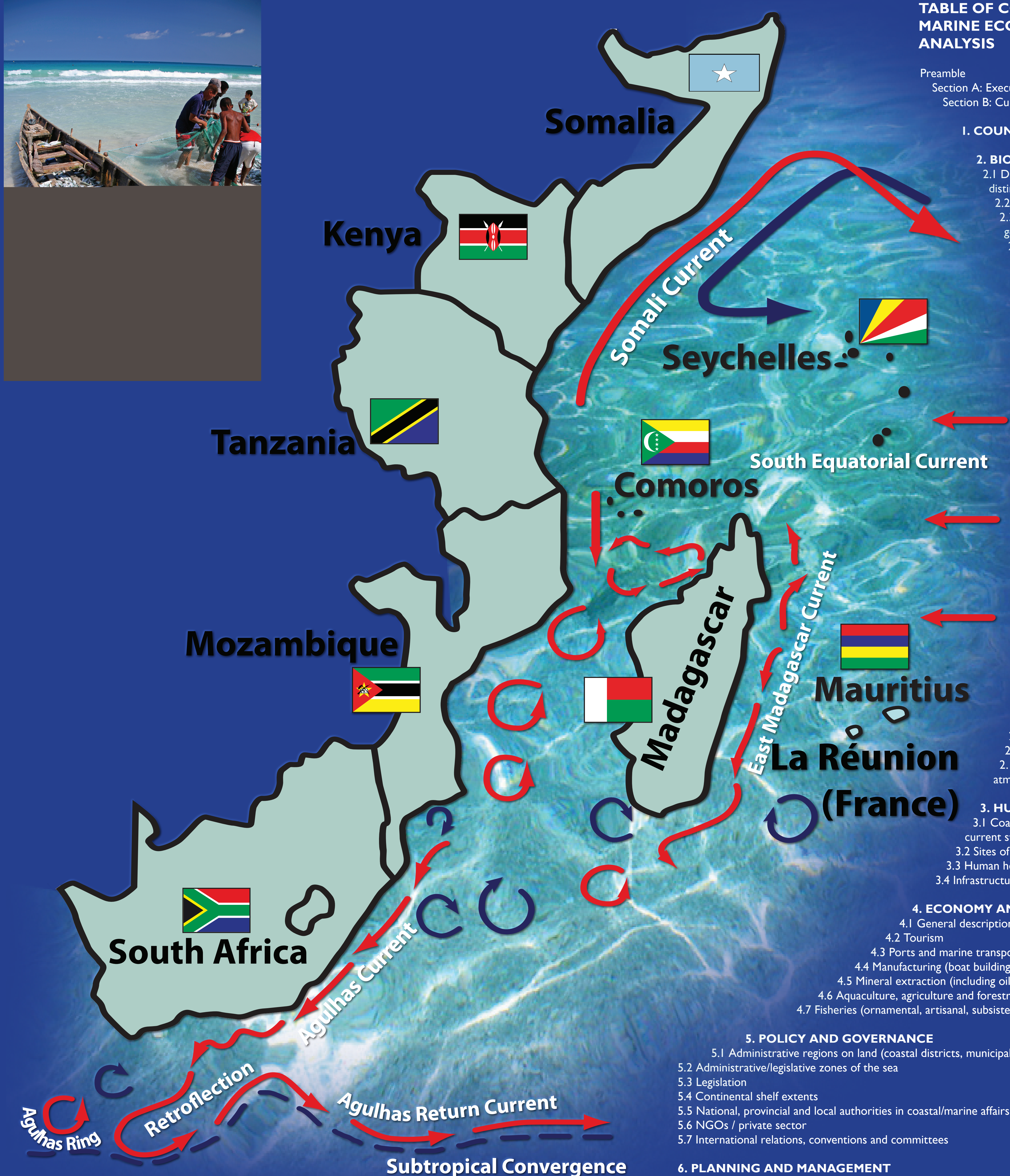
TABLE OF CONTENTS OF THE MARINE ECOSYSTEM DIAGNOSTIC ANALYSIS

Whilst the TDA/SAP process is very effective at the regional level, each MEDA will result in a nationally relevant publication and information resource for management of the marine ecosystem by each country. It will add a new dimension to the management of LMEs by better understanding the overall state of the environment within each country.