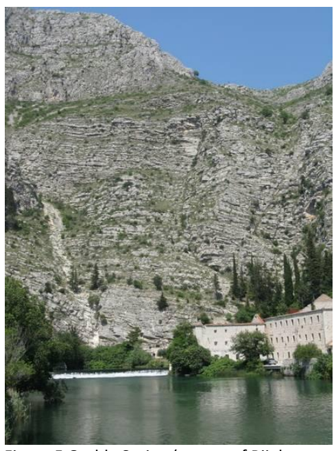
Figure 5 Ombla Spring (source of Rijeka Dubrovačka, Croatia)

getting water for their citizens from karst springs (Croatia is an exception). Almost all cities along Adriatic and Ionian coast depend on karst groundwater for their water supply (Stevanovic & Eftimi, 2010). Milanović (2005) stated that three large springs along the Neretva Valley and Adriatic coast (Buna, Bunica and Ombla - see Figure 5) and a few spring zones in the Boka Kotorska Bay (Orahovačka Ljuta, Spila, Sopot, Morinje Springs, Škurda and Gurdić) annually discharge more than 150 m³/s, on average. Some of these springs completely dry out during summer (e.g. Sopot, Spila), while after intensive rainfall or at the end of winter some of them can discharge over 100 m³/s (e.g. Sopot - see Figure 6). Some large springs are used for water supply such as Jadro (3–50 m³/s) for the city of Split (Bonacci, 1987). Regional water supply system for the Montenegrian coast was recently completed by intake constructed on the Bolje sestre Spring in the Skadar Lake basin (the minimum spring flow is 2.3 m³/s, Radulovic, 2000; Stevanovic, 2010).