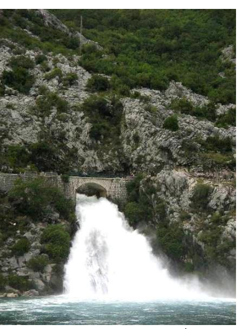
Figure 6 Sopot Spring near Risan (Montenegro) during peak flow discharge

In the Albanian karst there are roughly 110 springs with an average individual discharge exceeding 100 l/s. Of these, 17 have discharges exceeding 1,000 l/s (Eftimi, 2010). The majority of them are in the Dinaric part of the country (north from Vjosa). It is estimated that two thirds of groundwater resources in the entire country are in karst aquifers which provide more than 60% of the water consumed in Albania (Eftimi, 2010).