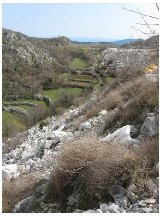
Figure 4 Small depression (uvala) used for crop cultivation (Orjen Mountain, Montenegro and Bosnia and Herzegovina)

cascade system of poljes is oriented. In the Nikšićko Polje (Montenegro), about 880 ponors and estavelles were identified, 851 of which are located along its southern perimeter.