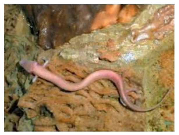
Figure 2 Proteus anguinus (proteus) is an endemic amphibian species found in the DIKTAS project region (IUCN conservation status: threatened). It is the only cave-dwelling chordate found in Europe.

production of electrical power. Most water supply systems in urban areas are regularly monitored for quality, while rural water supply systems may not be subject to any system of quality control. Percentage of total population connected to the public supply system varies from 48% (Entity of Republic of Srpska in Bosnia and Herzegovina) to 80% (in Croatia), with significant discrepancies between rural and urban areas. Water quantities used for industry and irrigation are significant, but those numbers rapidly decreased since 1990s. Floods are frequent in the project region due to the natural conditions, regime of the dams, and shortage of funds for flood protection.